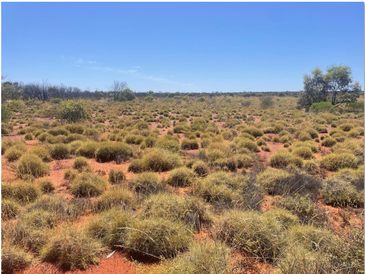
Figure 2 –Highly Prospective Western Greenstone Belt Suited to Soil Sampling for Drill Targeting

The majority of the 580km 2 Project will be covered with gridded soil sampling of spacing in the order of 400-800m x 100m on an east-west grid. Higher-priority areas will initially be covered by a 200m x 100m grid. Sarama intends to use the UltraFine+™ analytical process, developed and commercialised by the CSIRO (Commonwealth Scientific and Industrial Research Organization) specifically to assist in the exploration of the complex regolith conditions which are prevalent in the Eastern Goldfields of Western Australia (refer Figure 2). The method was not commercially available for the majority of the Project's exploration history and Sarama is keen to capitalise on this technical advancement in soil geochemistry which has been used by prominent mineral exploration companies including WA1 Resources, OreCorp, Sayona Mining and S2 Resources.