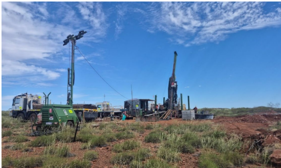
Figure 1. Diamond drill rig set up on the first hole at Carlow. Drilling 24hrs/day

Artemis Resources Limited (‘ Artemis ’ or the ‘ Company ’) (ASX/AIM: ARV ) is pleased to announce commencement of a substantial diamond and RC drilling program to test high priority gold exploration targets on the 100% owned Carlow Tenement within the Company’s extensive holdings in the North Pilbara gold province. Refer to Figure 2.