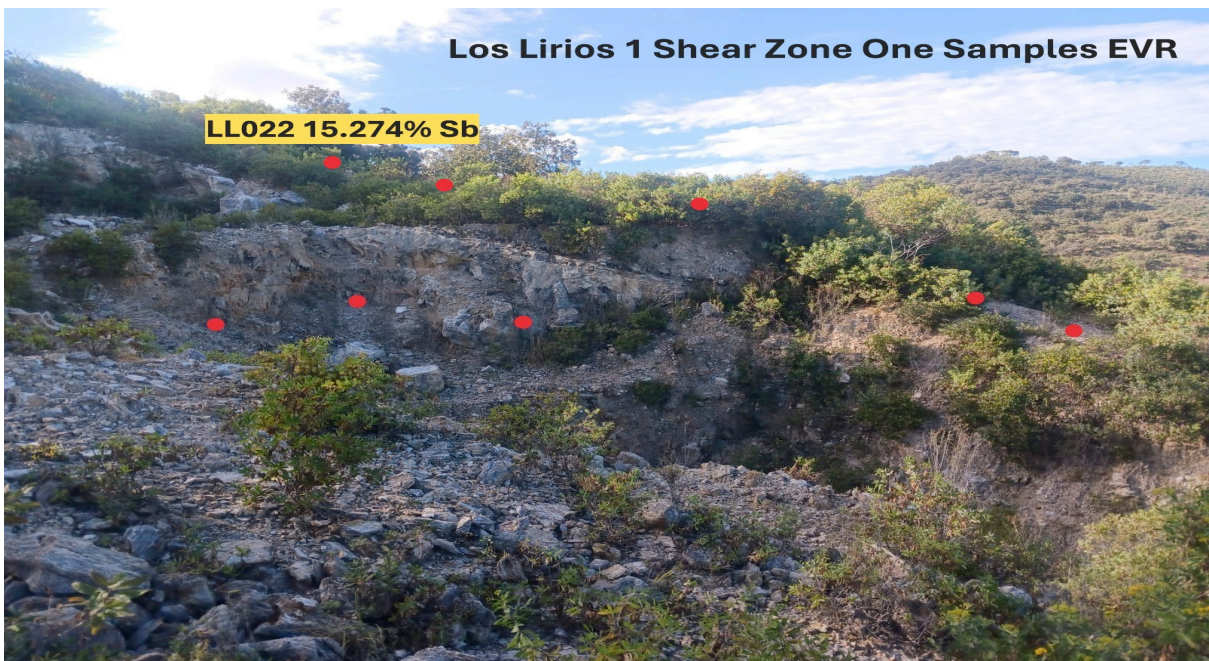
Photo 2 – Locations of Shear Zone One Samples at Los Lirios (red dots)

A further sample LL-022 taken from Shear Zone 1 at Los Lirios 3 returned an assay of 15.27% Sb . Further assay results are awaited.