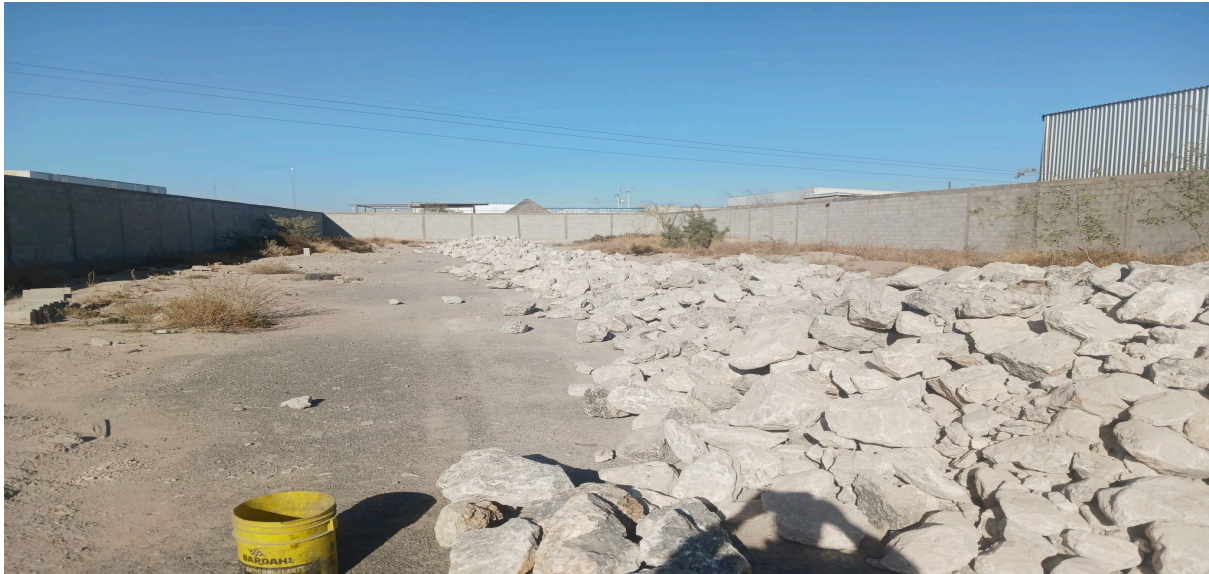
Photo 1 – Los Lirios material stockpile from which Samples SP-01, SP-02, and SP-03 were taken.

These samples SP-01, SP-02 and SP-03 returned assays of 29.17% Sb , 20.44% Sb , and 18.08% Sb , and have been sent for preliminary metallurgical test work at the Metallurgical Faculty at the Universidad Autonoma de Coahuila in Northern Mexico.