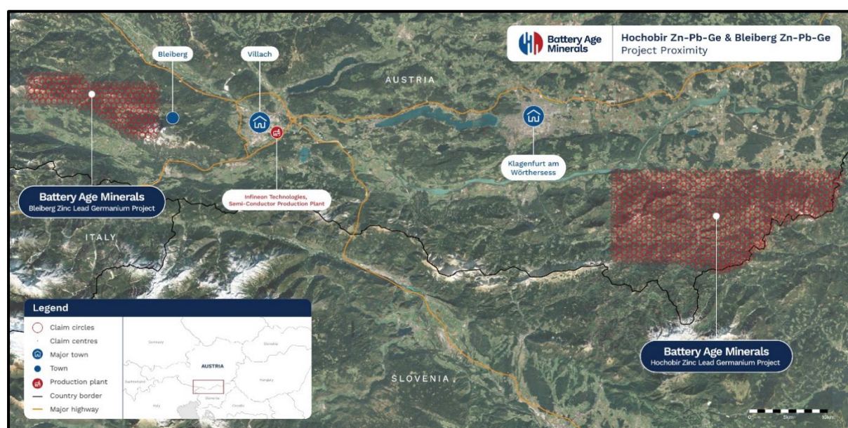
Figure 2: The Hochobir Zinc Lead Germanium Project is located approximately 60km east of The Company's historic Bleiberg project in Austria.

The Company staked approximately 600 exploration claims that cover 290km 2 of tenure prospective for Lead-Zinc-Germanium mineralisation during the Period. The new project area is a part of a regional geological domain that contains evidence of lead and zinc mineral occurrences, adits and historical workings which extend over 30km corridor from west to east. The project area covers historic workings and mineral occurrences; Hochobir, Remshenig, Topitza and Petzen as well as the Fladung Germanium showing which has recorded historic grades of up to 900 g/t Ge (Cerny and Schroll, 1995, Scroll 1996, Höll et al., 2007)(refer announcement 23 December 2024).