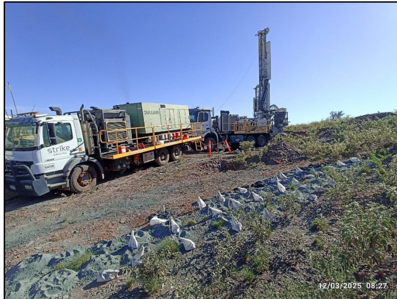
Figure 1 RC Drilling underway at Tambourah King.