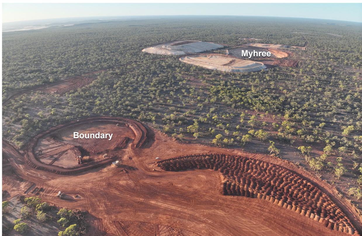
Figure 2: Boundary waste stripping in the foreground, with Myhree in the background (to the south).

Boundary topsoil stripping and pre-stripping are now underway in preparation for initial grade control drilling in March and April 2025.