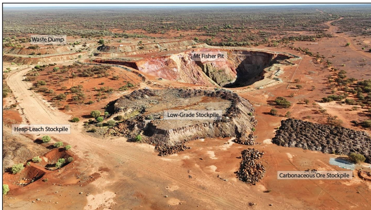
Figure 1- Image looking north-west showing historical pit, waste dumps and stockpiles