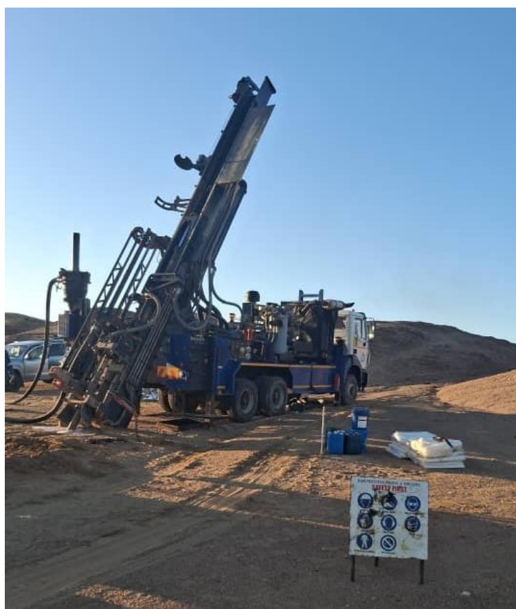
Figure 1. Drilling is underway at the Etango North-East Project