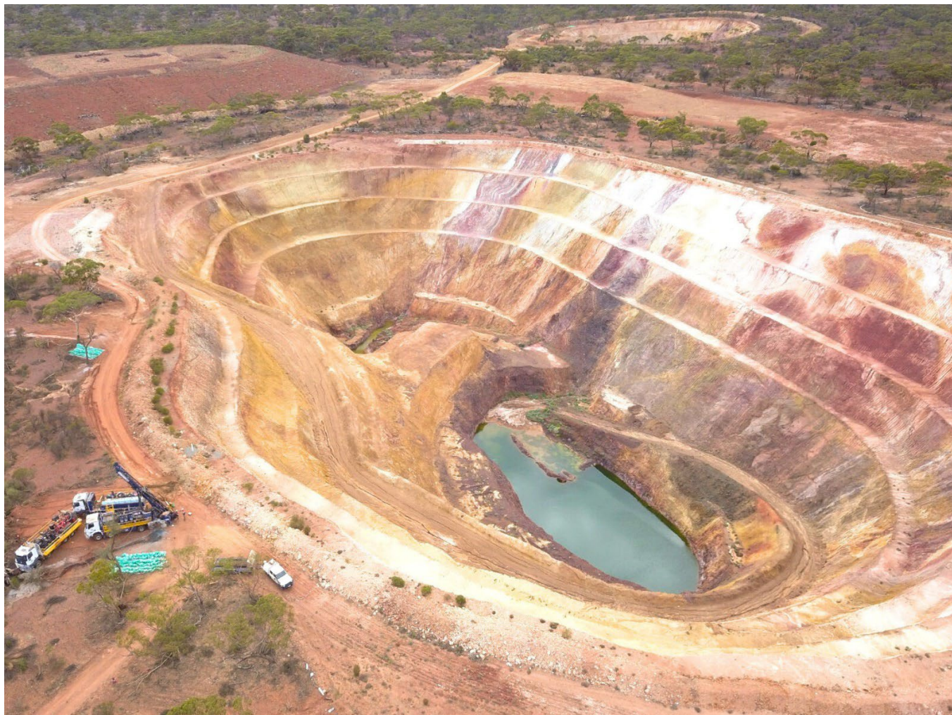
Figure 1 RC rig on site at Marda Central, drilling along strike from historical open pits, April 2025.