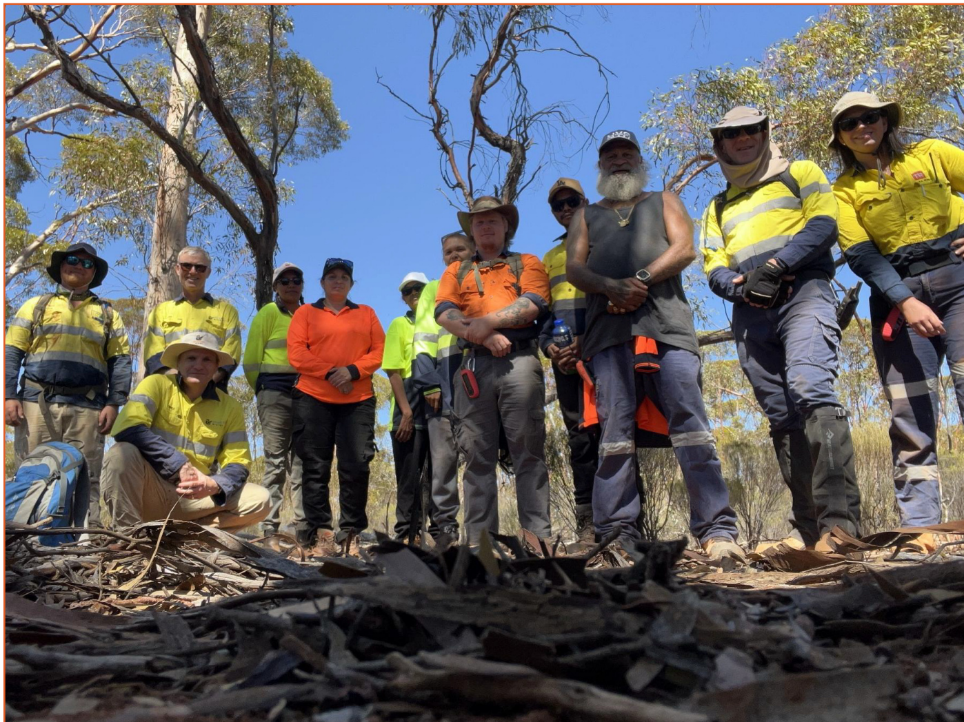
Figure 2: Southern Cross East Heritage Survey team including representatives of the MG traditional owners.

An archaeological and ethnographical heritage assessment of the survey area was successfully completed on 26 March 2025 with the co-operation of Marlinyu Ghoorlie Native Title Claimant Group (“MG”). The survey area covered the highest priority drill target areas over a robust “gold in soil” anomaly supported by associated gold pathfinder elements outlined by the Company’s two previous ultrafine soil sampling programs and verified with conventional soil sampling techniques (refer to ASX announcement dated 4 June 2024). The anomaly’s proximity to an interpreted major structure and fault splay (Figure 1) suggests the potential presence of a gold mineralisation system which can only be verified by drilling.