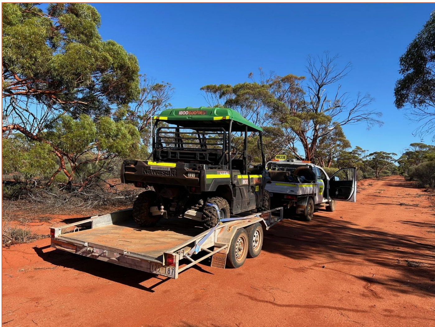
Figure 3: Mobilisation of equipment to support the Heritage Survey at Southern Cross East.

“The completion of the recent Heritage Survey at our Southern Cross East project, conducted with the cooperation of the Marlinyu Ghoorlie Native Title Claimant Group completes the approvals process and now the Company can focus on deploying personnel and equipment to site to complete the ~1,000m air-core gold drilling program. GSM has previously defined a robust “gold in soil” anomaly supported by associated gold pathfinder elements which were defined in previous soil survey campaigns. Being close to an interpreted major structure and fault splay does potentially suggest the hallmarks of a buried gold mineralisation system. Given no previous exploration work has been conducted in this region, we feel the work that GSM has undertaken so far certainly justifies the execution of a targeted drill program over the soil anomaly area and look forward to completing this program.”