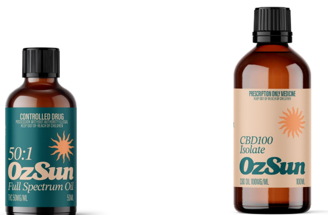
Figure v: New value-oriented product line, OzSun Medicinal Cannabis Oils

Following the success of the launch of OzSun flower as part of the Company's B2C strategy aimed at making medicinal cannabis more accessible, after Easter ECS will launch a new lower-priced product line, OzSun Medicinal Cannabis Oils. These oils will be supplied in larger volumes to cater for patients with chronic illnesses.