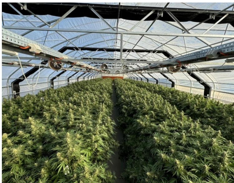
Figure iii: New PCE's delivering 50% more yield compared to original PCE's