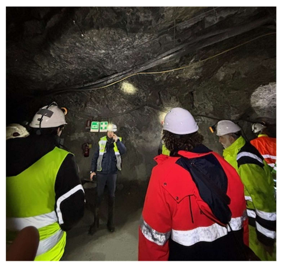
Figure 3: Site visit with EIA Committee 12 March 2025

Subsequently, on 19 March 2025, the Regione Lombardia issued a new decree for the Cime EL authorising access for checking of tunnel stability, recording water flow rate, maintaining safety and security and continuing with the environmental monitoring plan activities. The decree conditions are in place pending the completion of the EIA procedure, which has a statutory duration of 180 days determined from the submission date of 24 February 2025. The duration of the EIA procedure can be extended to accommodate responses to additional stakeholder requests for clarifications, so it is estimated this may take approximately 10 to 12 months based on Altamin's previous experience.