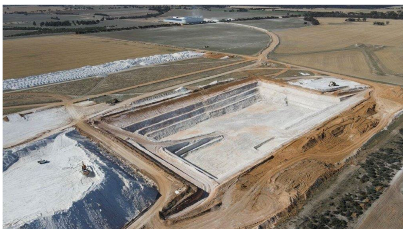
Figure 1 - Mining Operations at Wickepin