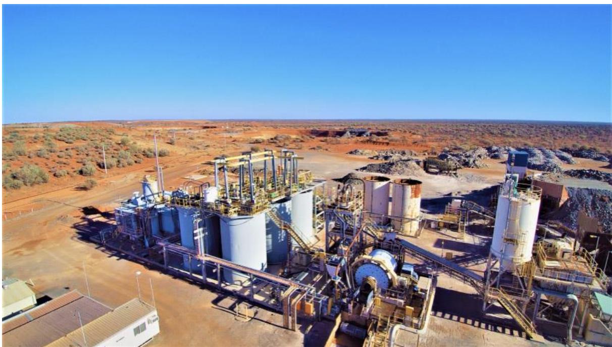
Figure 3 - Burnakura gold processing plant

During the quarter, the Company executed a Memorandum of Understanding for Mill Access and Collaboration (“MOU”) with its Tuckanarra Gold Project joint venture partner, Monument Murchison Pty Ltd, to collaborate on studying options to process ore from the Tuckanarra Gold Project at Monument’s nearby Burnakura gold processing plant.