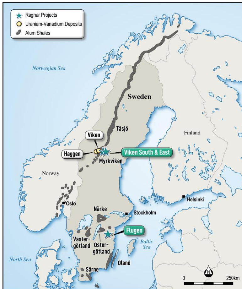
Figure 1: Map of Scandinavia showing the distribution of alum shales (black), which are the primary host rock for uranium mineralisation in Sweden, and the location of Ragnar's new energy projects (green) in relation to nearby uranium-vanadium deposits 1

On 14 February 2025, Ragnar announced the results of reprocessed VLF geophysical data over the recently granted Viken Project in Sweden. The analysis highlighted prospective structural trends across the area. In addition, the Company completed a significant compilation and review of historical drilling data at both the Viken East and Viken South projects, further enhancing the geological understanding and exploration potential of these highly strategic licences.