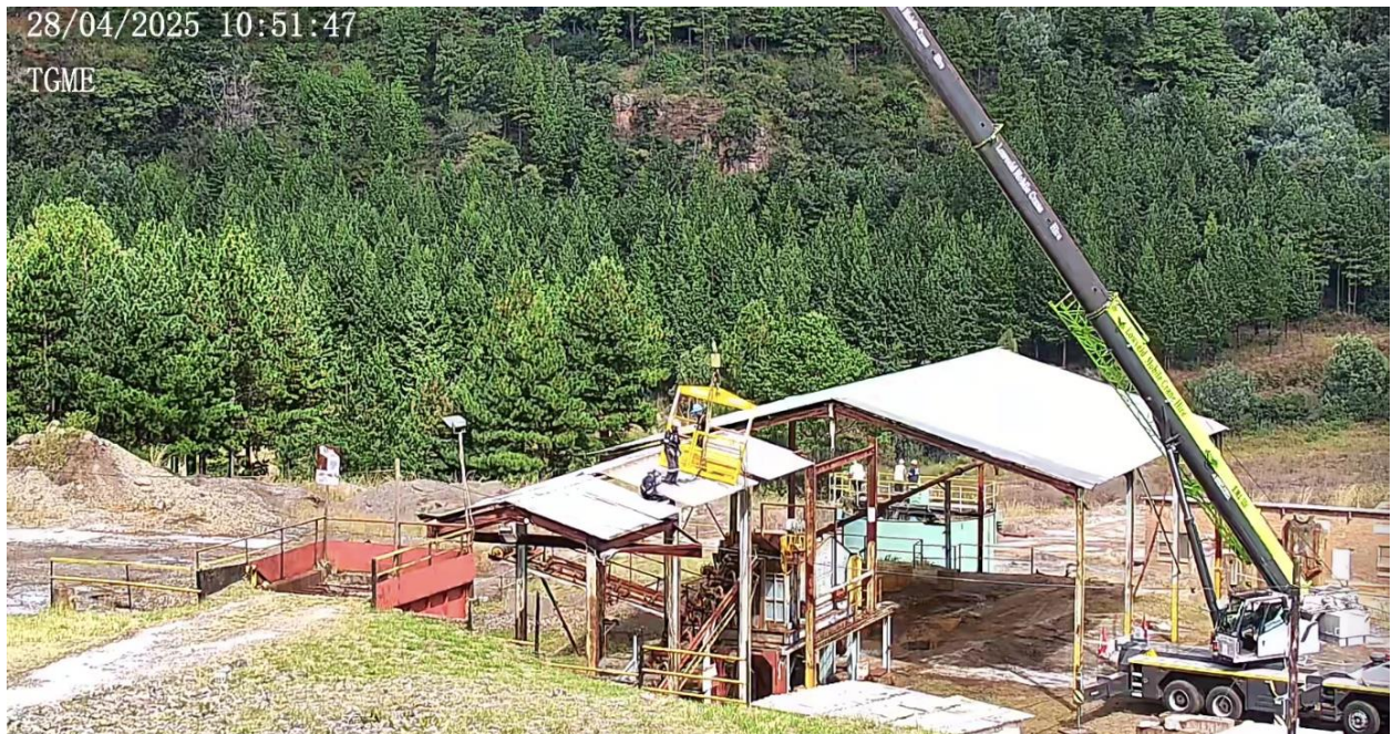
Figure 3: Removal of old mill sections

The removal of old steel structures, roofing and mill civils will be removed during the following weeks. The team plans on drilling and blasting the old mill civils and storing all the steel structures in the salvage laydown area.