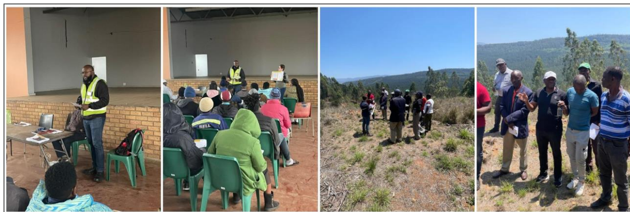
Figure 8: Stakeholder Engagement Meetings – Rietfontein Scoping phase