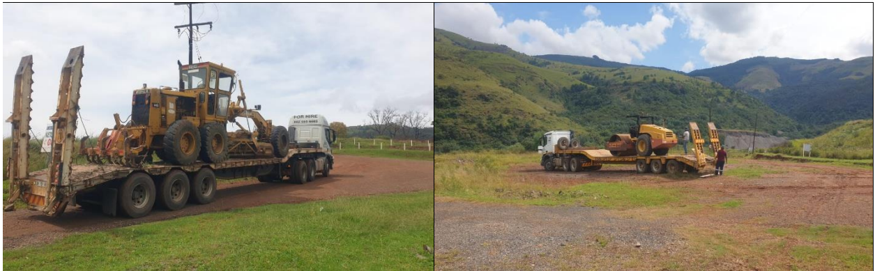
Figure 2: Delivery of contracted Grader and Roller

The team contracted yellow equipment providers from the local community to assist in preparing the salvage laydown areas. The salvage laydown area is located within the northeast corner of the processing plant, adjacent to the planned run-of-mine ore storage pad.