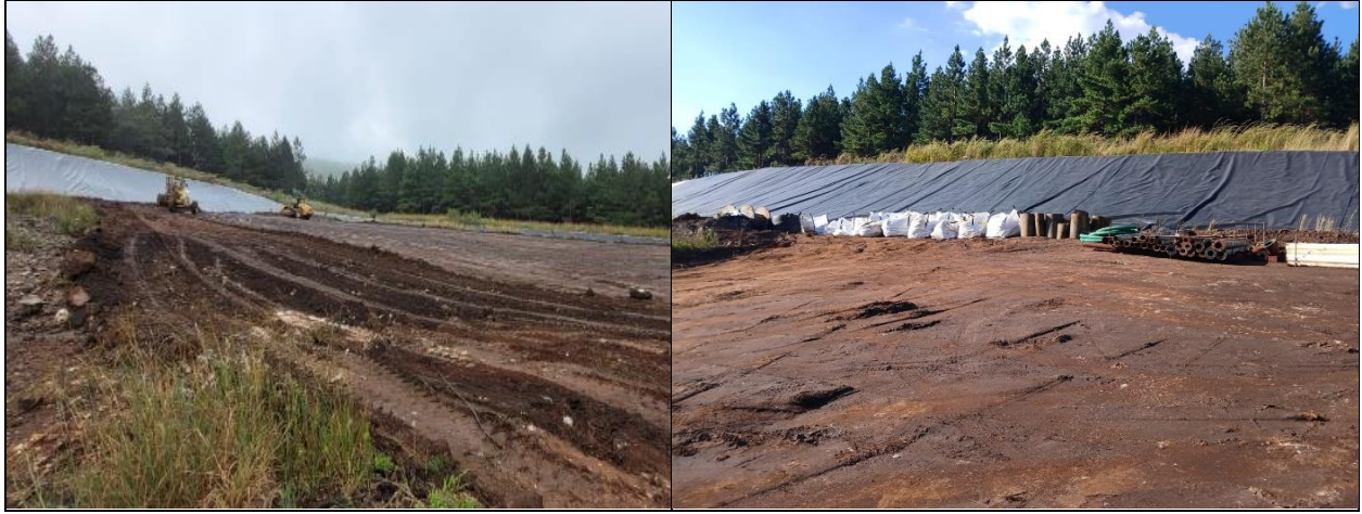
Figure 4: Salvage laydown area