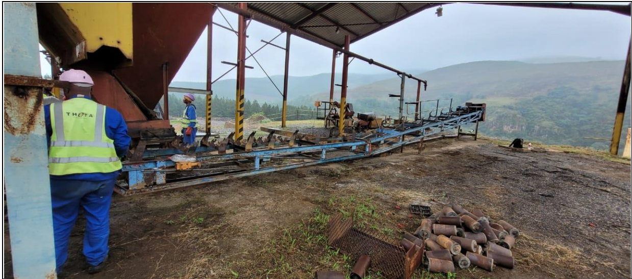
Figure 5: Removal of old conveyor belt structure