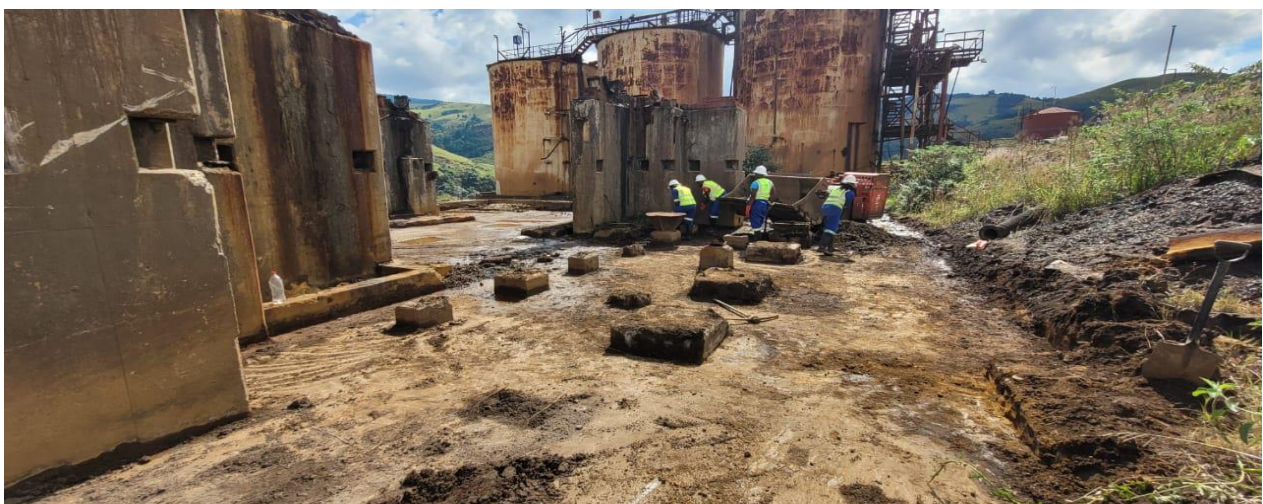
Figure 1: Cleaning of old mill structures in preparation for drilling and blasting