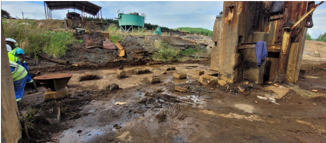
Figure 6: Old mill civils to be removed

The pre-project execution work is planned to be completed by the end of May 2025. This work will ensure that the plant footprint is prepared for the project's bulk earthworks to start without any delays once the project is ready for execution.