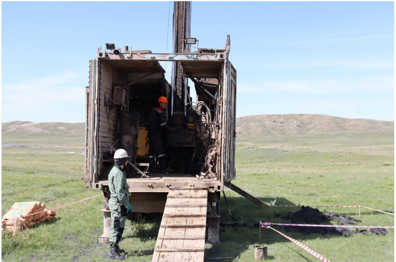
Figure 1 – Reserve definition drilling commences in the Central Graphite Zone, May 2025.