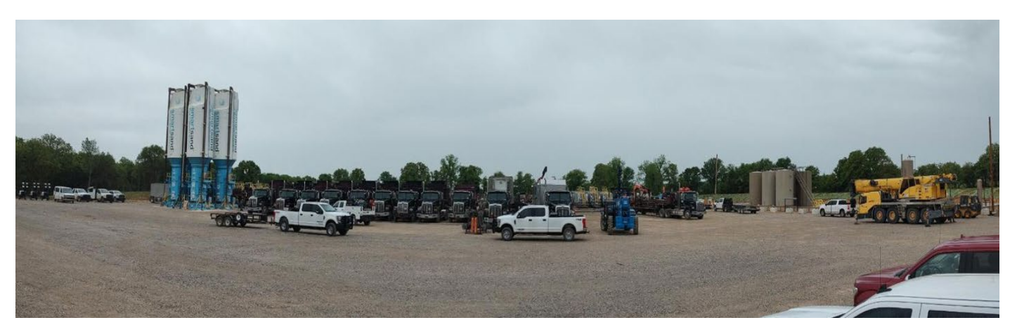
Figure 1: Completion crews and equipment mobilised on site at the Bruins Well. Infrastructure includes high-pressure pumps, sand silos, fluid storage units, and service vehicles ahead of 24-hour hydraulic fracturing operations.

These steps will pave the way for initial production and sales, which remain scheduled for the second quarter.