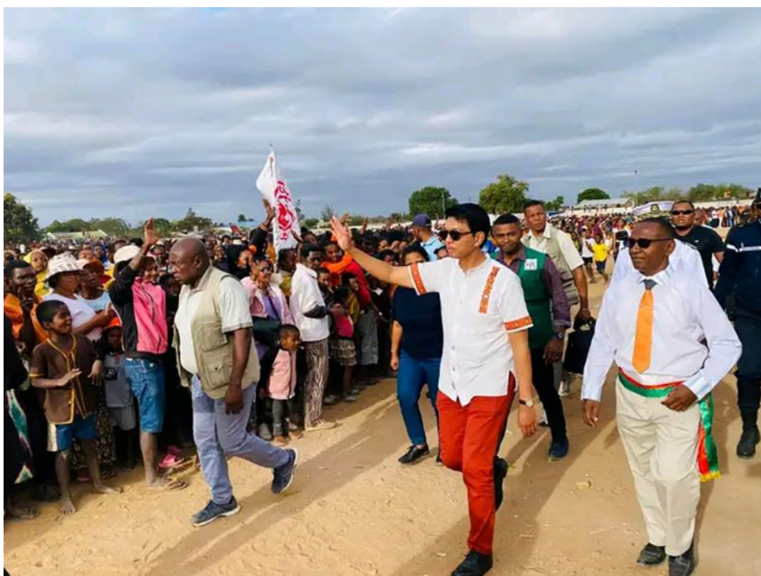
Figure 1: President Andry Rajoelina greets residents of Ampanihy during official launch of RN10 rehabilitation works – a transformative infrastructure initiative connecting southern Madagascar. 4

The RN10 development aligns with Madagascar’s national strategy to unlock economic growth through infrastructure and positions the southern region — and Maniry — for long-term participation in global supply chains for critical raw materials.