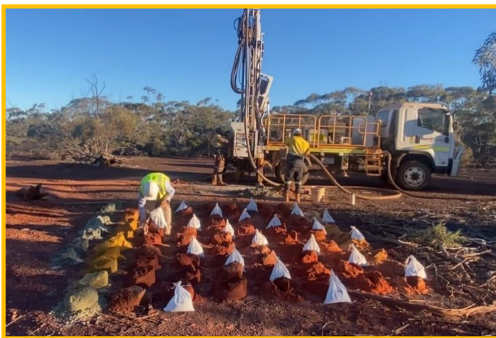
Photo 2 & 3: Star West alluvial workings and Penny's Fault AC samples.