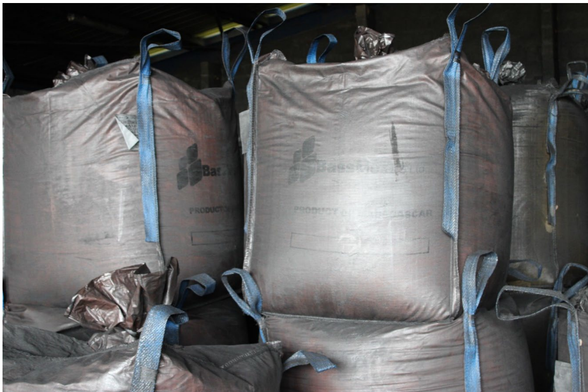
Figure 5 Dried graphite stock in store