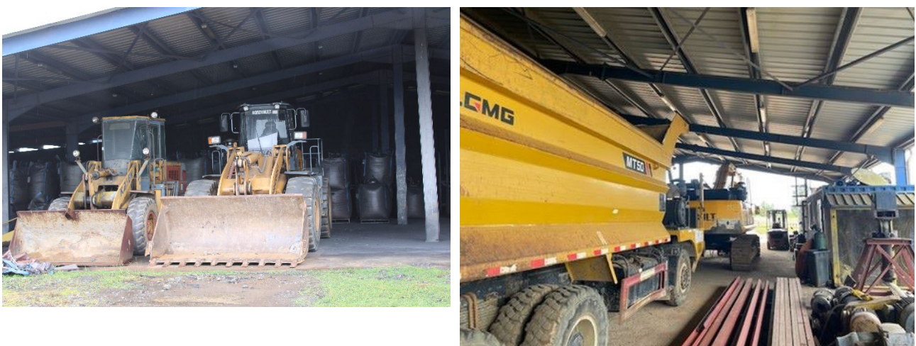
Figure 1 Mobile plant and equipment

The Graphmada site has been well maintained over the care and maintenance period with all access roads, plant and infrastructure in good repair. Whilst at site Greenwing executives conducted a review of all equipment in stores and have identified considerable excess stock that the Company intends to monetise over the coming quarters. The Company holds a comprehensive inventory of yellow goods, spare mill motors, critical spares, grinding media and parts, some of which can be seen below.