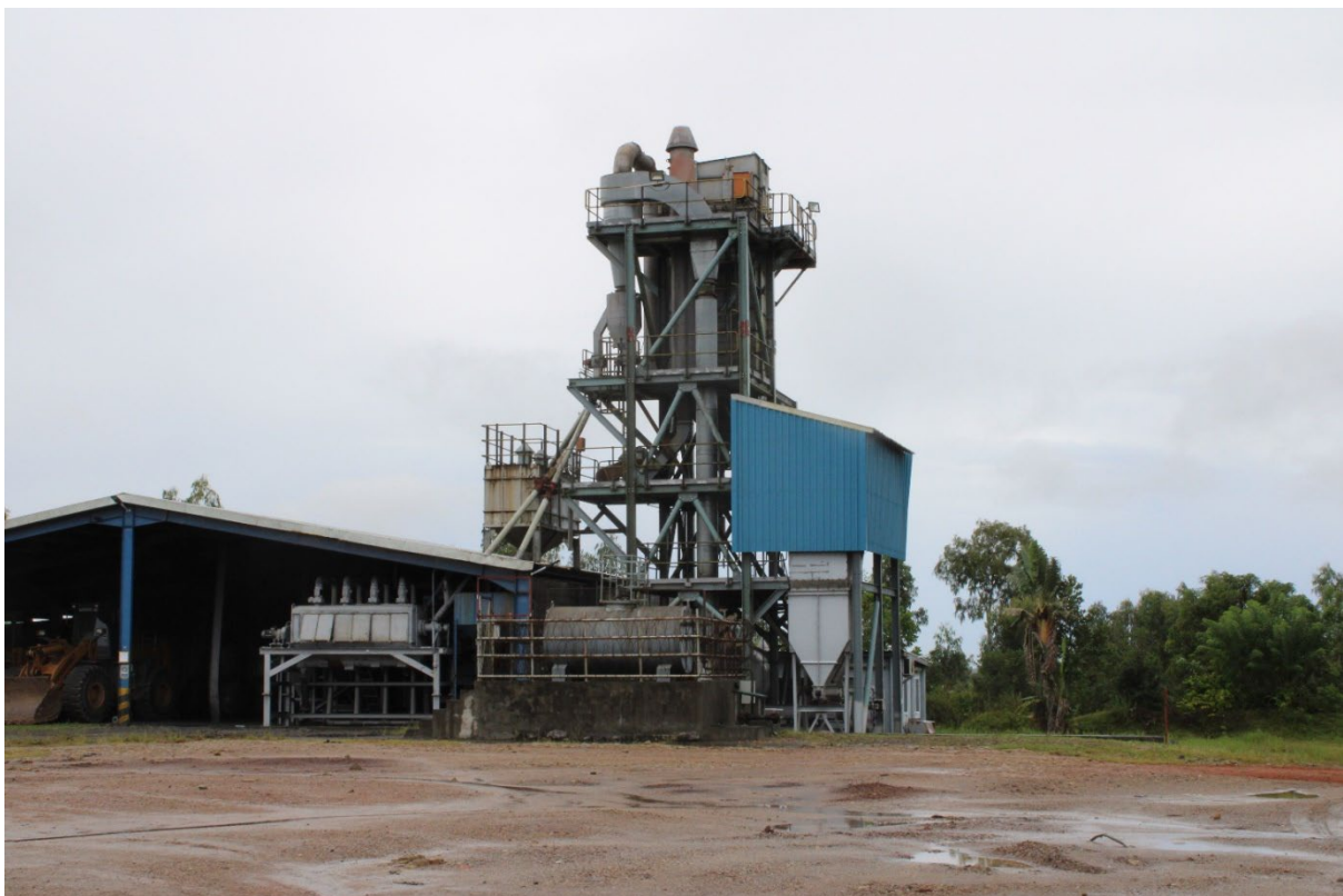
Figure 8 Graphite dryer and equipment stores