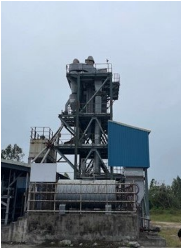
Figure 2 Graphite concentrate dryer