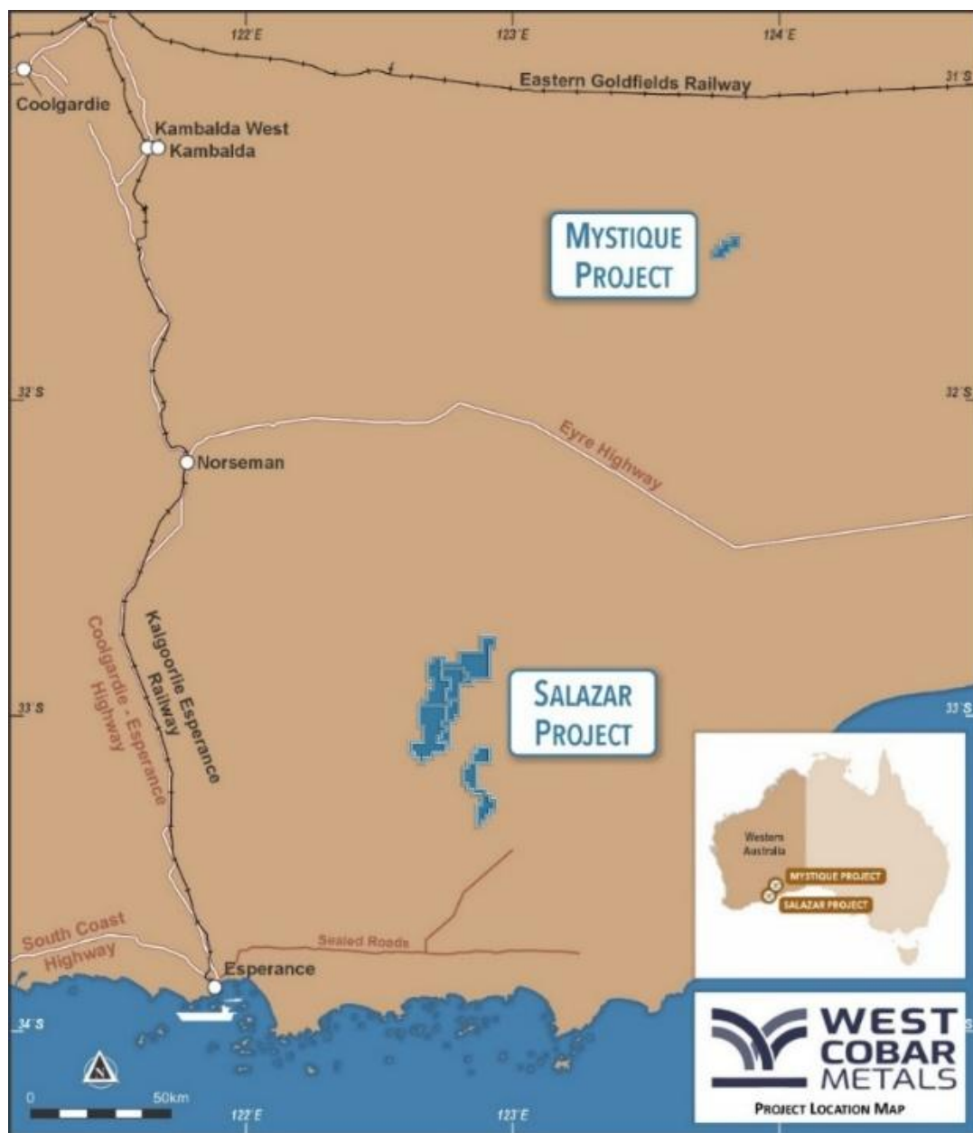
Figure 1: Location of Mystique Project and West Cobar's Salazar Project in the Fraser Range