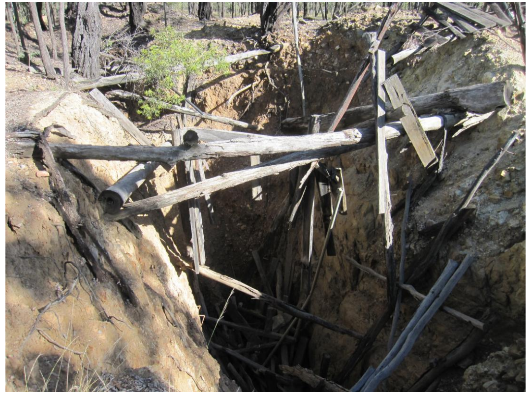
Figure 1. Historic Banshee Antimony-Gold Mine Workings

The Banshee Sb-Au Prospect has a 650 m strike length as defined by previous drilling and is open at depth and along strike. In the shallow drilling completed to date, the sub-vertical fault-controlled quartz-vein hosted mineralisation is up to 7 m wide (down-hole width). Details about the previous work at Banshee including GDM's recent trench sampling program are included in an ASX Announcement dated 15 November 2024.