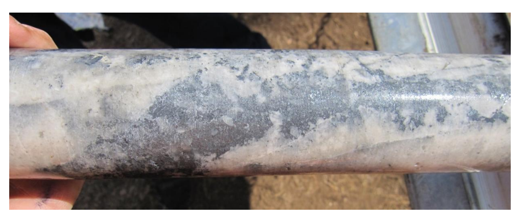
Figure 2. Stibnite-Quartz mineralisation in diamond drill core, from hole CNDD001.

Recent petrophysical test work on historical diamond drill core (see Figure 2 ), showed that the Antimony-Gold mineralisation has significantly higher chargeability and resistivity values, compared to the surrounding host rocks. In addition, IP forward modelling work by Mitre Geophysics indicates that a detailed dipole-dipole IP survey using 25 m dipole spacings, will be an effective exploration tool that will identify zones of Sb-Au mineralisation at depth and along strike. The proposed IP Survey is located wholly within GDM's EPM 16216. Work is expected to commence in the coming months with the final reports are due by January 2026.