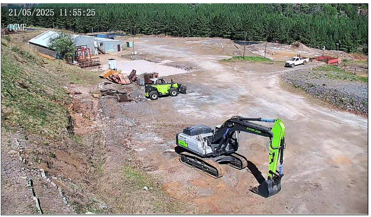
Figure 6: Initial new bulk earth equipment delivered

As previously announced (10 June 2025¹), the Company has locked in a 13-year renewal of Mining Right 83 ("MR83") through to 2038 — a key approval covering the Beta, CDM, and Frankfort mines, which together account for over 75% of current FS mine schedule. This renewal cleared a key condition