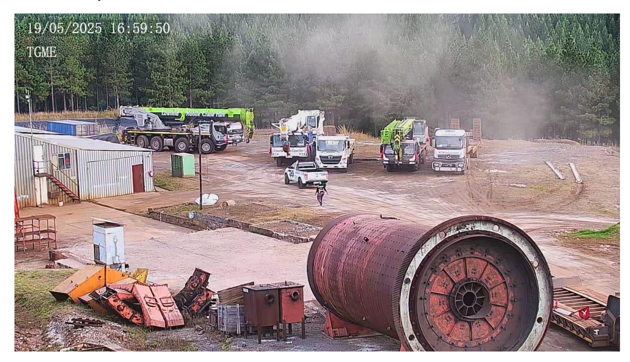
Figure 1: Mobile Cranes and Flatbed Trucks assisting in deconstructing the old plant.