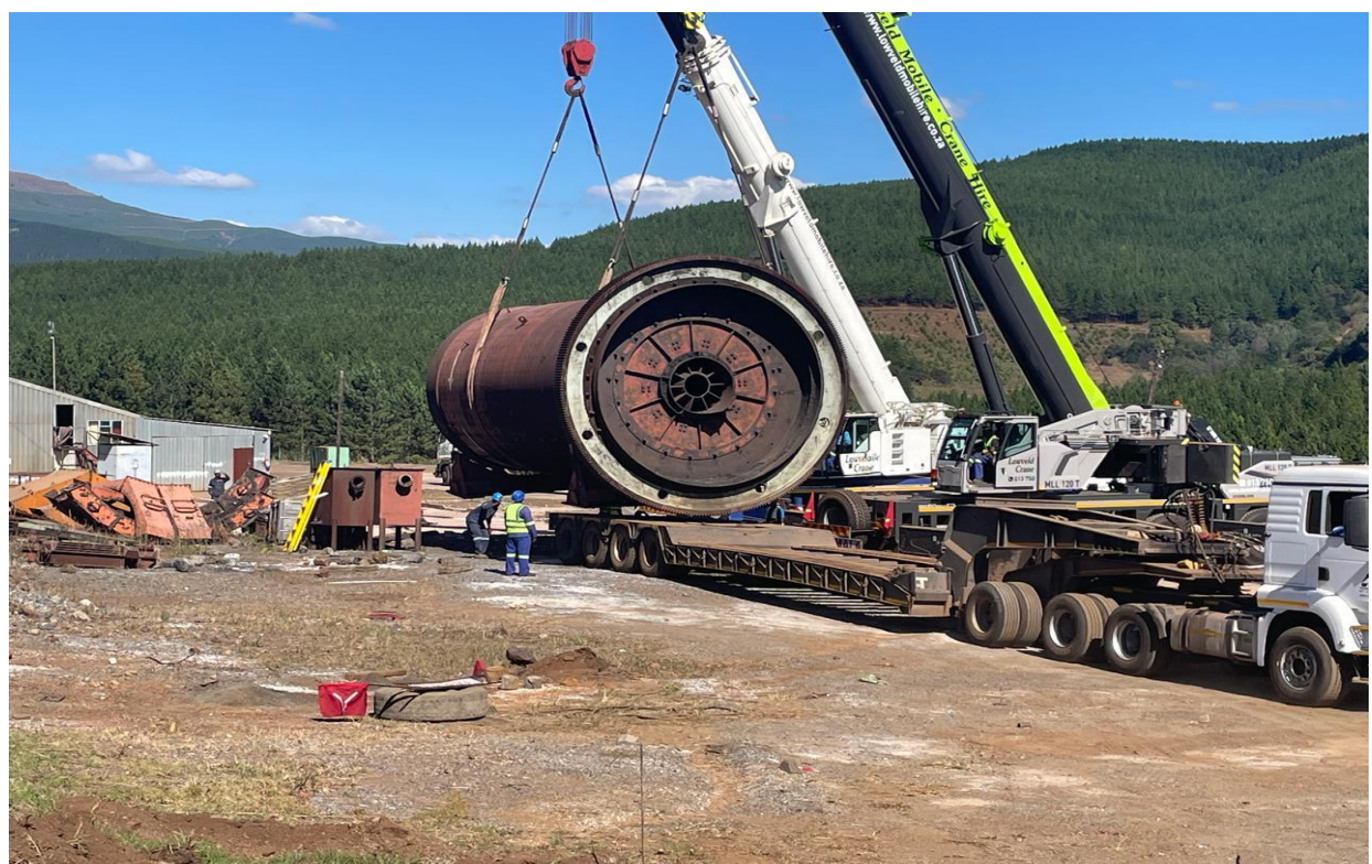
Figure 5: Lifting and loading of the big ball mill for transport to the laydown area