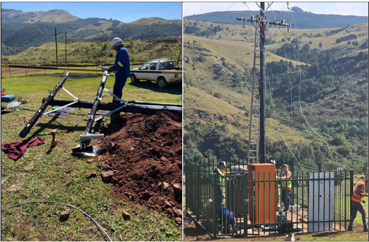
Figure 3: Installation of temporary electrical plant supply