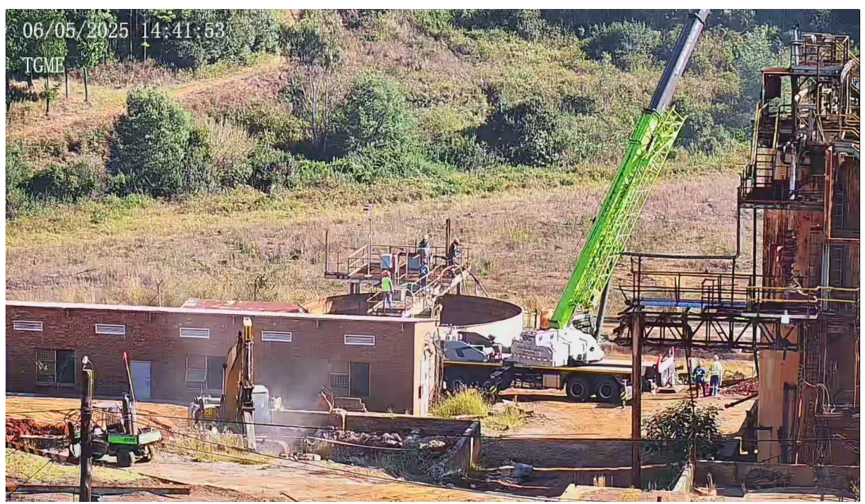
Figure 2: Removal of old mill civils and thickeners