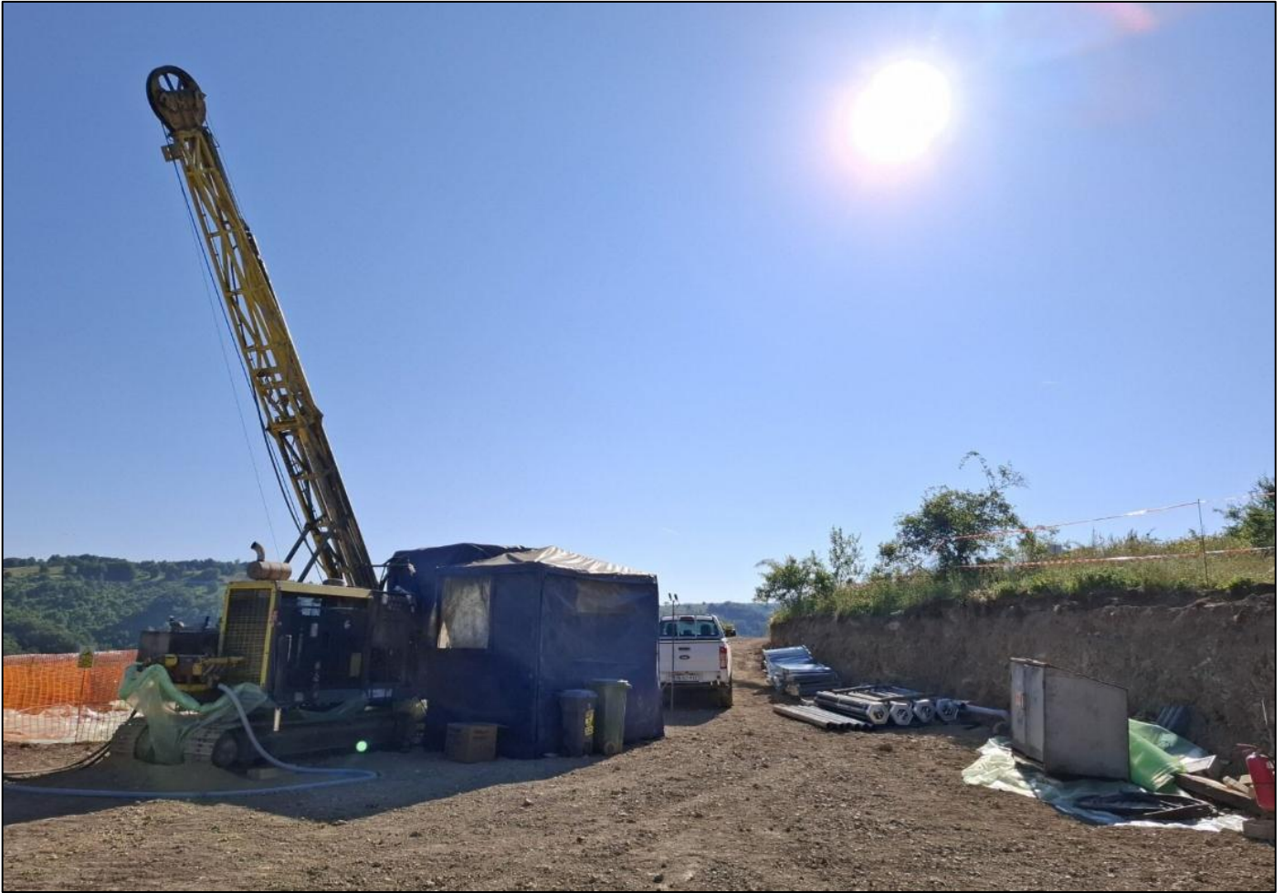
Figure 2. Photo of the seventh diamond rig set-up at Gradina.