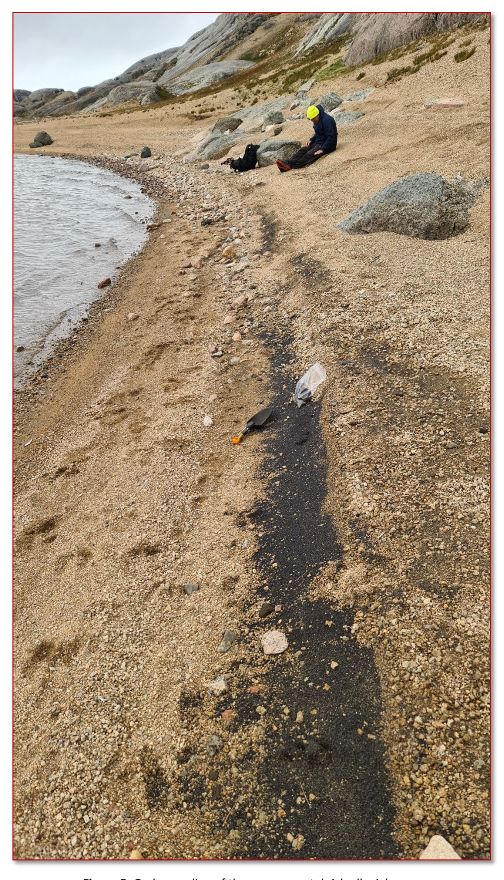
Figure 5: Grab sampling of the course crystal rich alluvials.