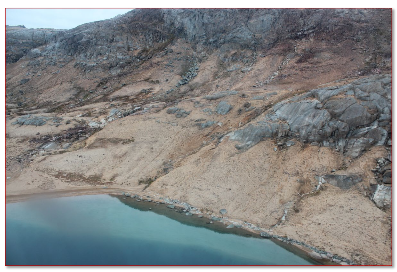
Figure 3: Colluvial and alluvial weathering accumulations from granitic country rock surrounding Blue Lake.