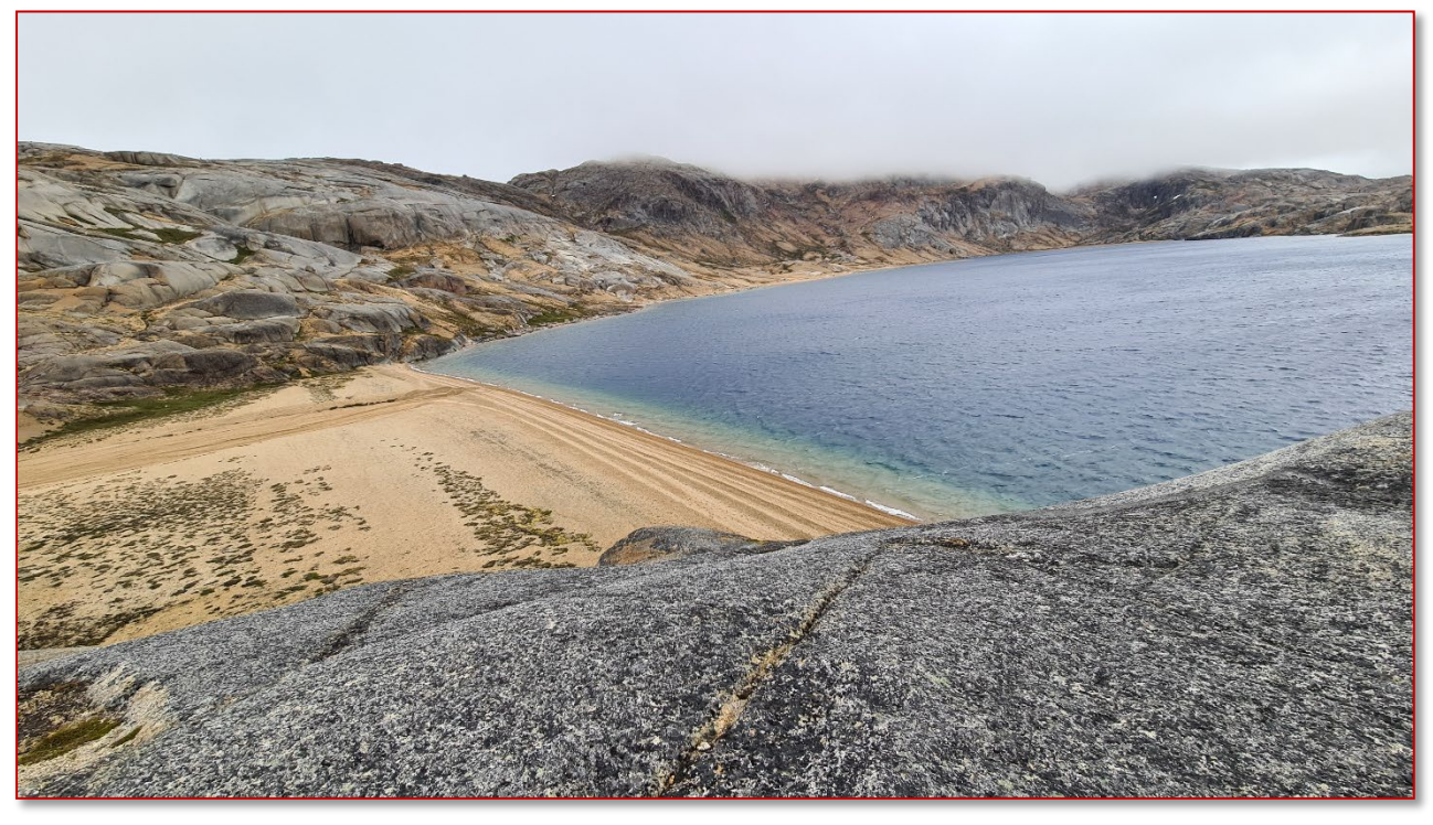
Figure 4: Coarse crystal rich 'beach' at Blue Lake.