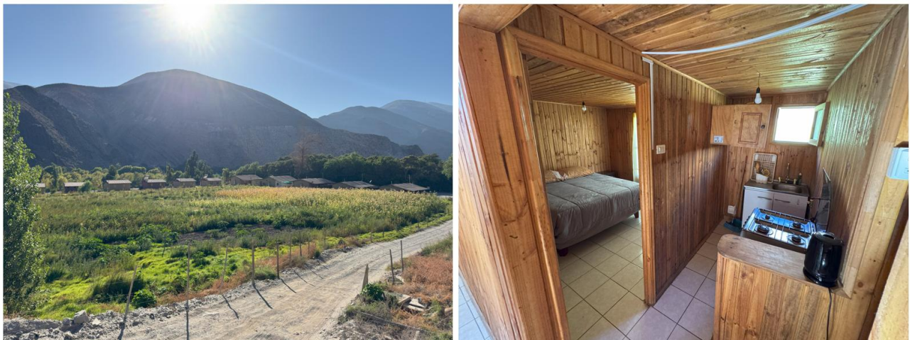
Figure(s) 3: Villas at Carmen Copper Operations Camp located at Alto de Carmen

This announcement has been authorised by the directors of Norfolk Metals Ltd