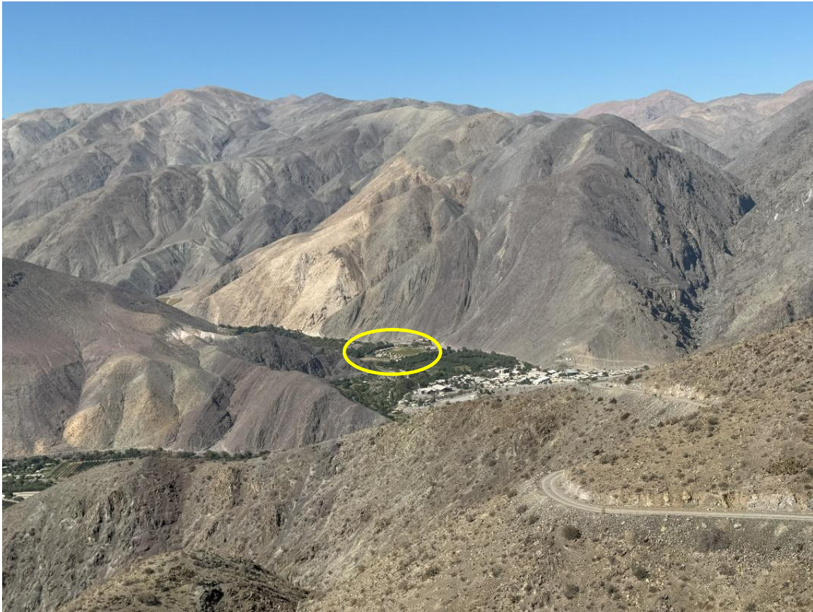
Figure 1: Township of Alto del Carmen viewed from the north along access roads to the Carmen Copper Project. Yellow oval shows Carmen Copper Operations Camp location.