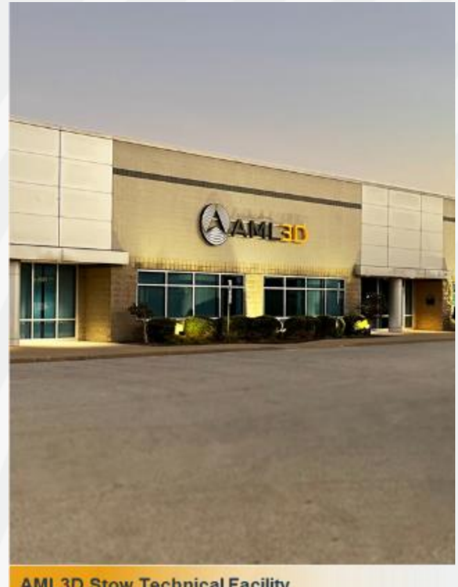
AML3D Stow Technical Facility