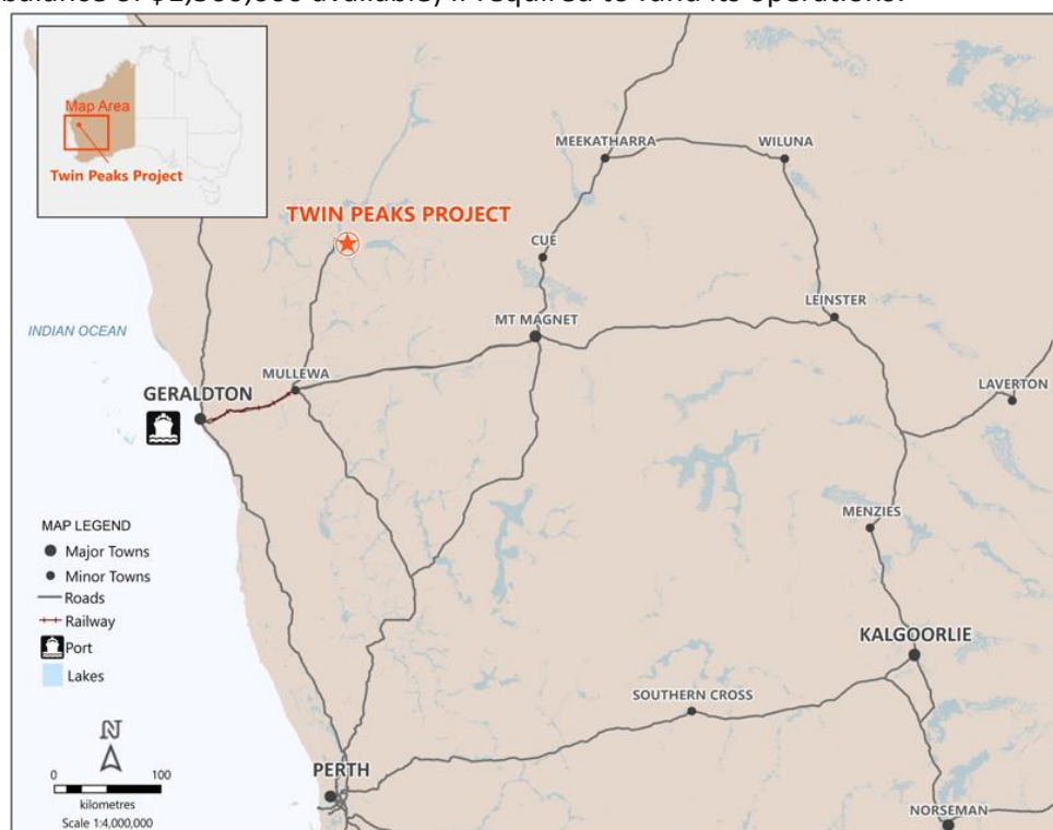
Figure 1: NTM Minerals – Western Australian Project Location

During the interim period from the date of this announcement until the general meeting at which shareholder approval of the disposal will be sought (proposed to be held in early August 2025 as set out in the indicative timetable below), and subsequent to the general meeting if shareholder approval is not obtained, the Company has the ability to drawdown further on its existing convertible note facility (with a remaining balance of $1,560,000 available) if required to fund its operations.