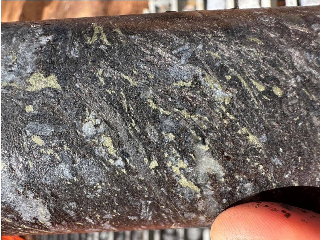
Figure 3. Chalcopyrite mineralisation intersected in a biotite-quartz-garnet-kyanite ore schist in NCRD009

Assays have been received for two other holes completed at Nyungu Central during May and June 2025 (NCRD005 and NCRD026).