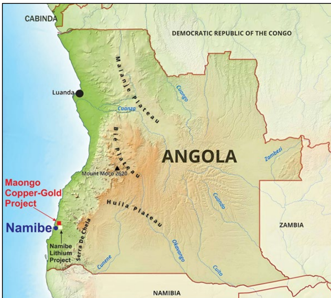
Figure 1. Location of the Maongo Copper-Gold Project, approximately 25km northeast of Namibe.

Targets generated will be drilled as they are generated.