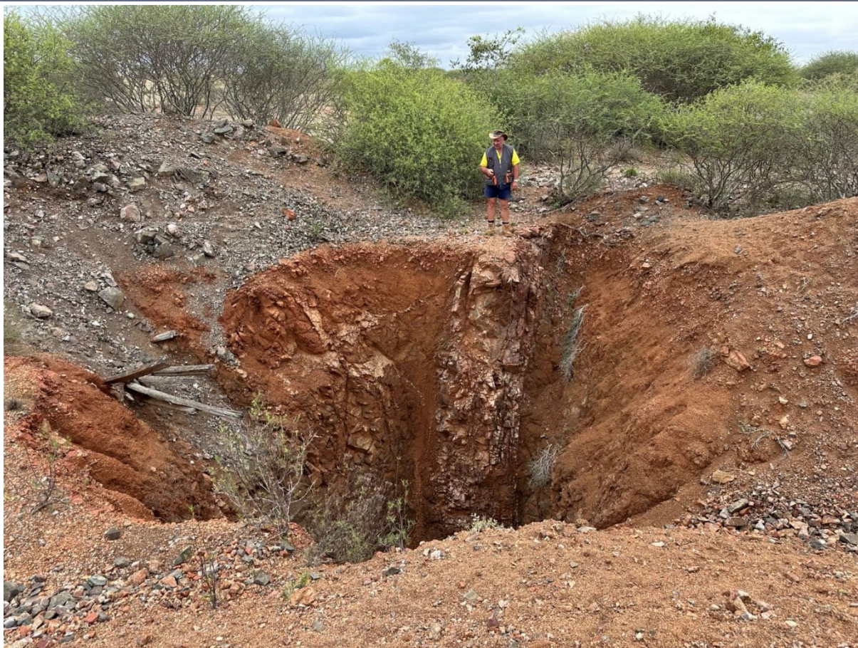
Figure 10: View west across the collapsed, main Cacimba shaft.