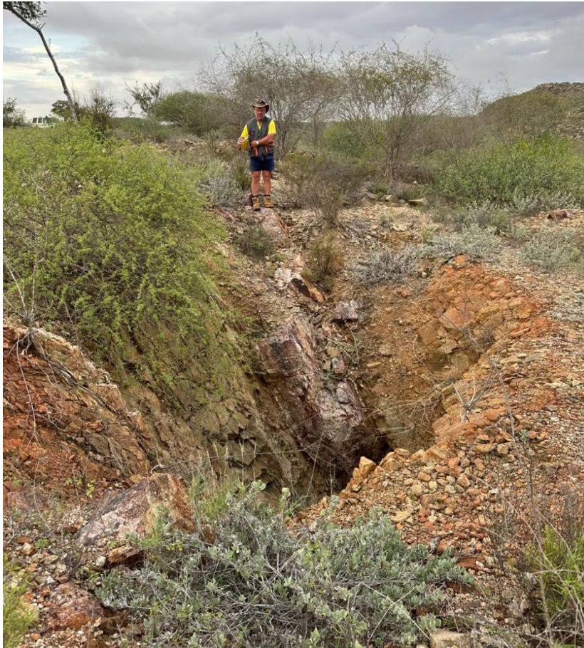
Figure 8 : View north across shaft, 200m south of mine in Figure 7 (Conango Canpungo workings).