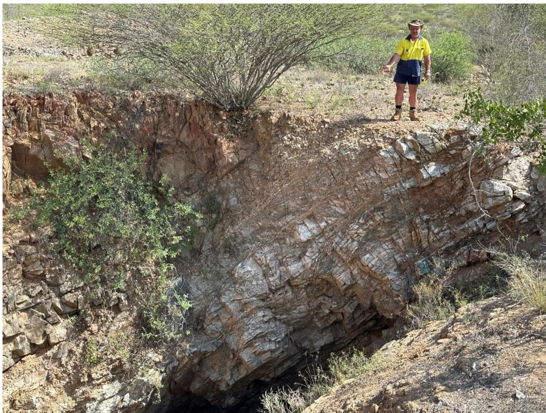
Figure 5: Detailed view of the thick laminated quartz vein in shear zone (Maongo group); see figure 4.