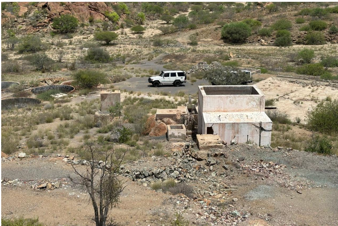
Figure 3: View westwards across remnants of the historical Maongo Ore Treatment Plant.