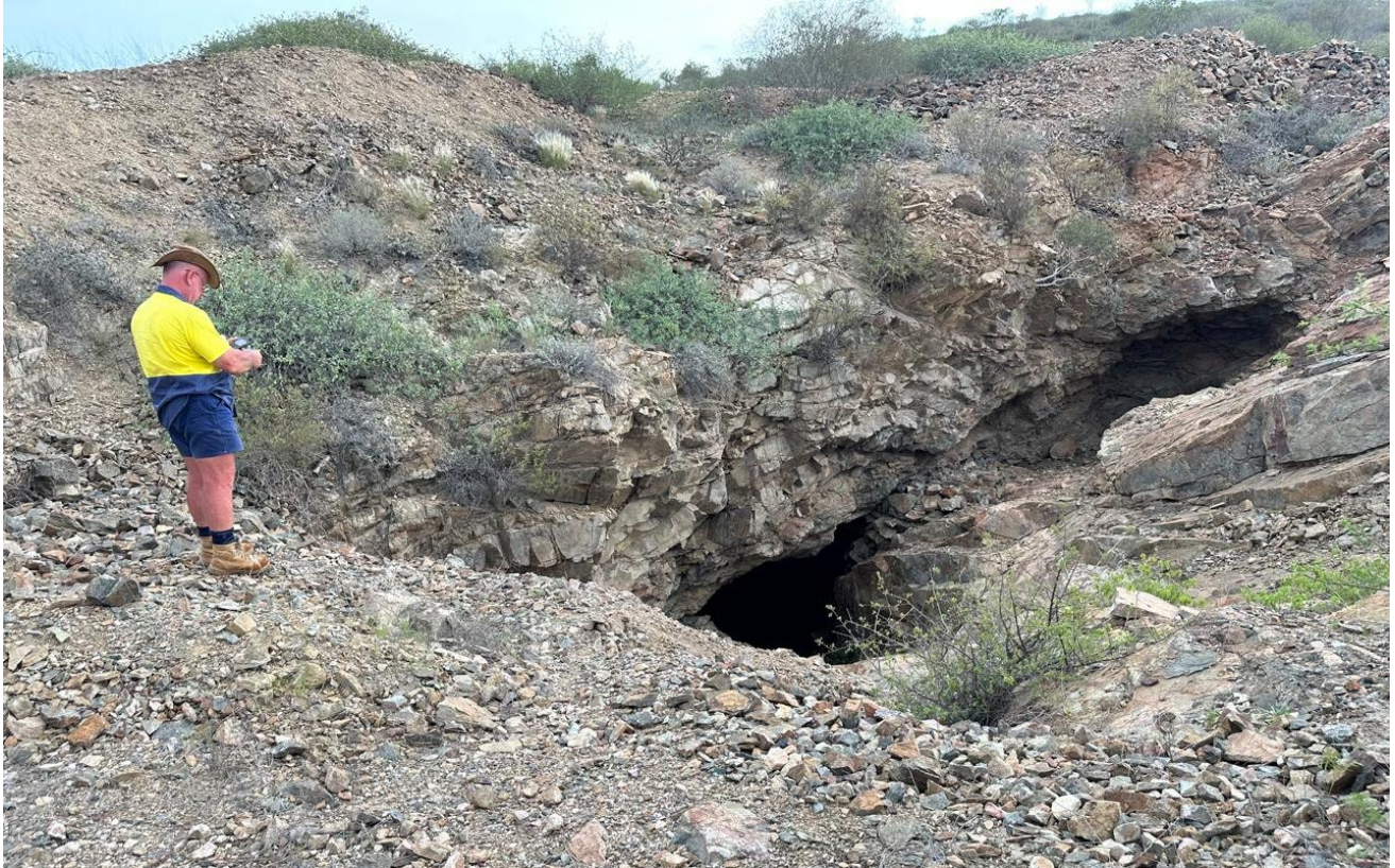
Figure 6: View southwest of historical underground mine (Maongo group) 1.9km east northeast of mine in Figures 4 and 5.