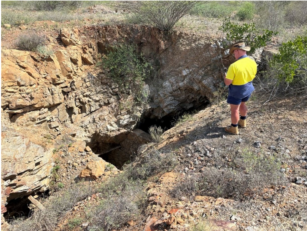
Figure 4: View south of a well-constructed historical mine; Maongo group.