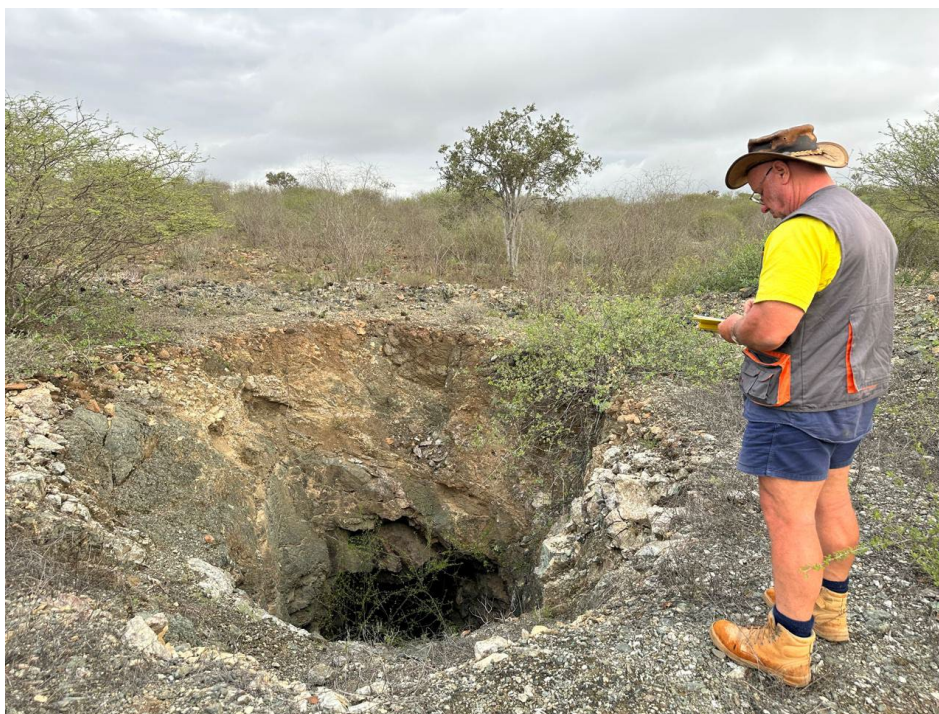
Figure 9: View east across shaft, 170m south of mine in Figure 8 (Conango Canpungo workings).