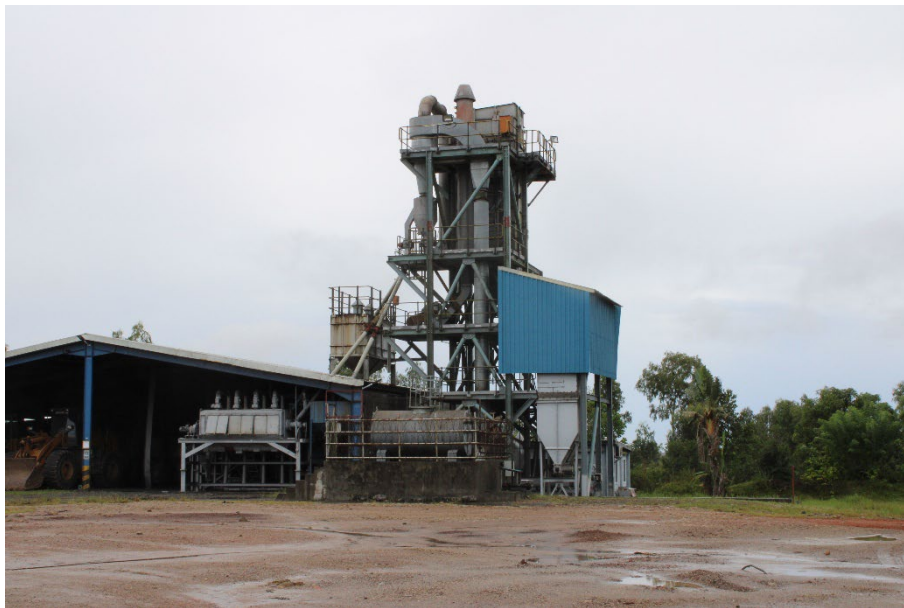
Figure 4 Graphite concentrate dryer at Grpahmada

During the quarter, care and maintenance activities continued on site.