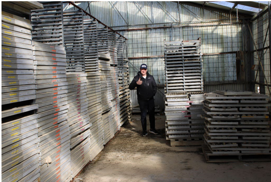
Figure 9 Core shed at Que River

Care and maintenance activities continued on site during the quarter.