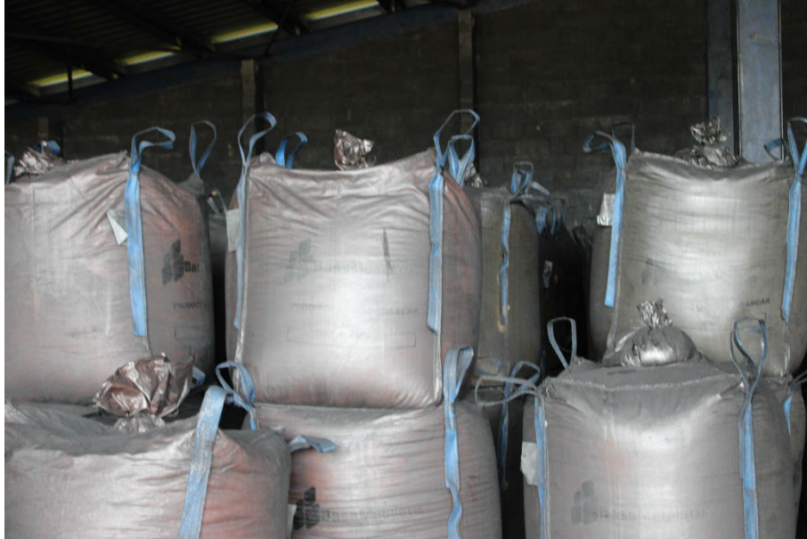
Figure 5 Graphite concentrates in warehouse store