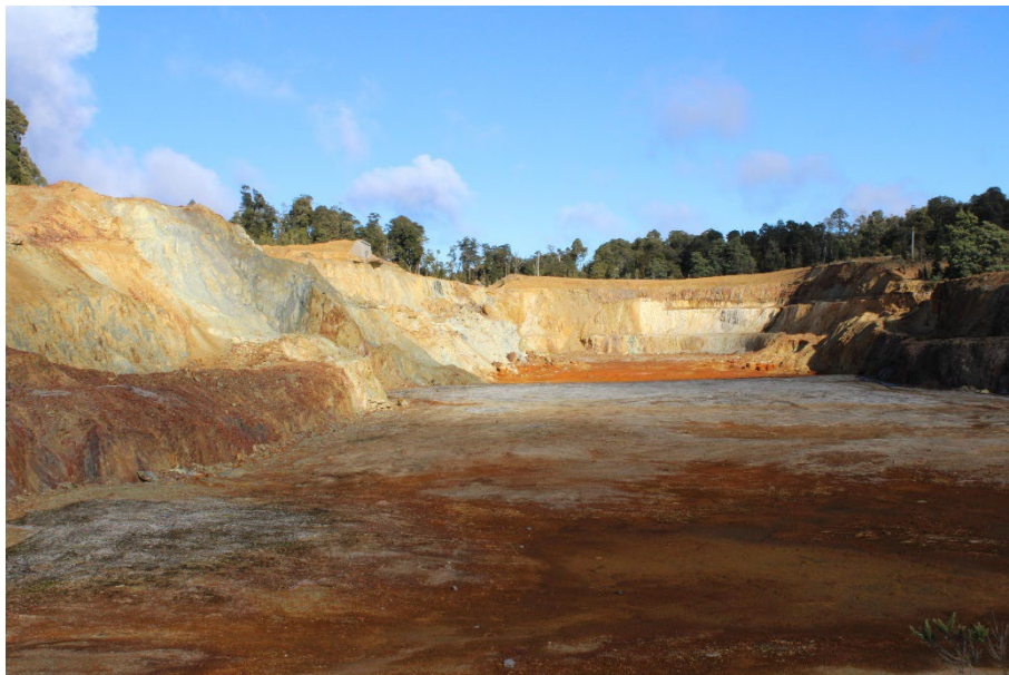
Figure 8 Que River open pit

For complete JORC disclosures please refer to ASX Announcement dated 25 March 2025 'Greenwing tables updated Polymetallic Mineral Resource at Que River'