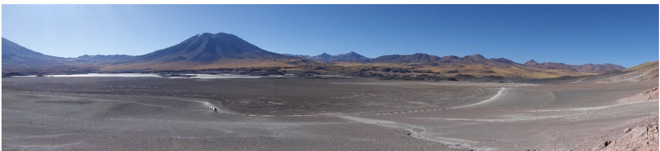
Figure 1 – San Francisco Salar looking west.

These results from two leading providers of DLE processing technologies, IBC and Xtralit 2 , in addition to other test work completed, confirm that the San Jorge Brine is highly amenable to DLE processing.