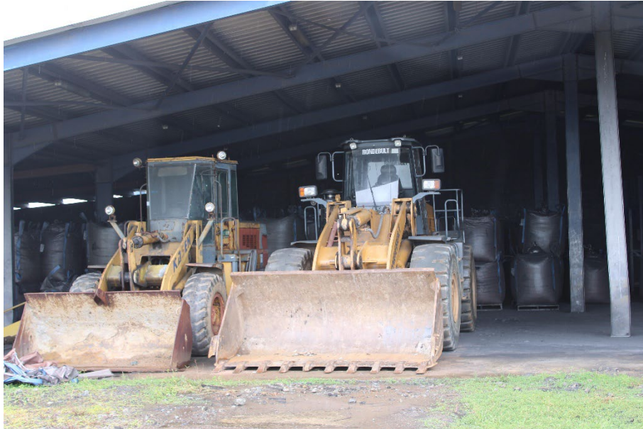
Figure 6 Graphmada plant and equipment

The site visit concluded with surplus spares and equipment identified for sale. The Company is progressing with a sale process aimed at bolstering its cash position.