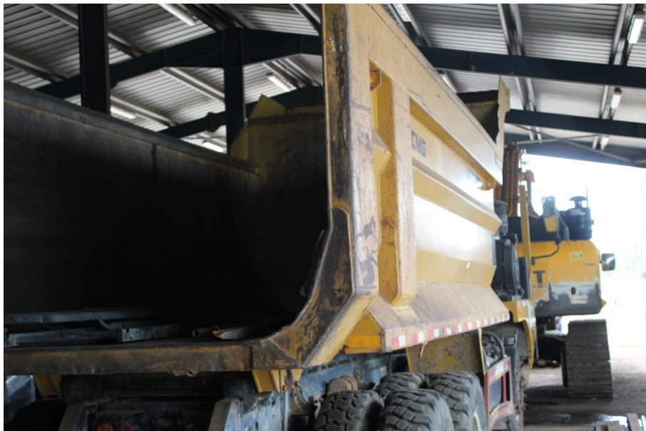
Figure 7 Graphmada plant and equipment