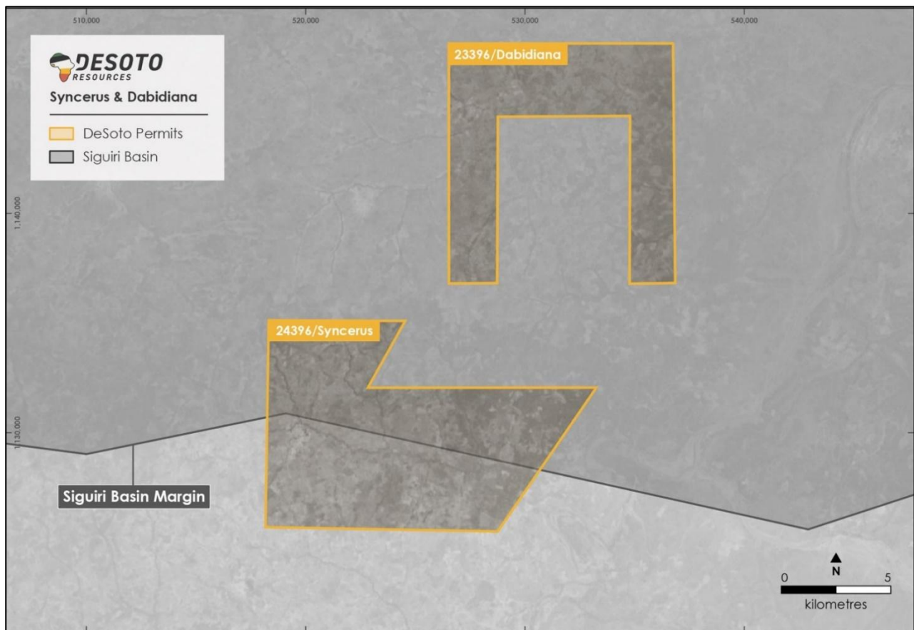
Fig. 2 – Syncerus Gold Project reconnaissance permit shown in proximity to the Dabidiana permit and the Siguiri Basin margin.

Syncerus is located less than 5km southwest of the Company's Dabidiana Project and totalling 99.8km 2 (Fig. 2).