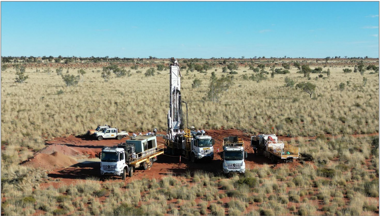
Figure 1. RC drilling at the West Arunta Project

Tali Resources Ltd (ASX: TR2) ( Tali or the Company ) is pleased to advise that its initial reverse circulation ( RC ) drilling program has commenced at the West Arunta Project.