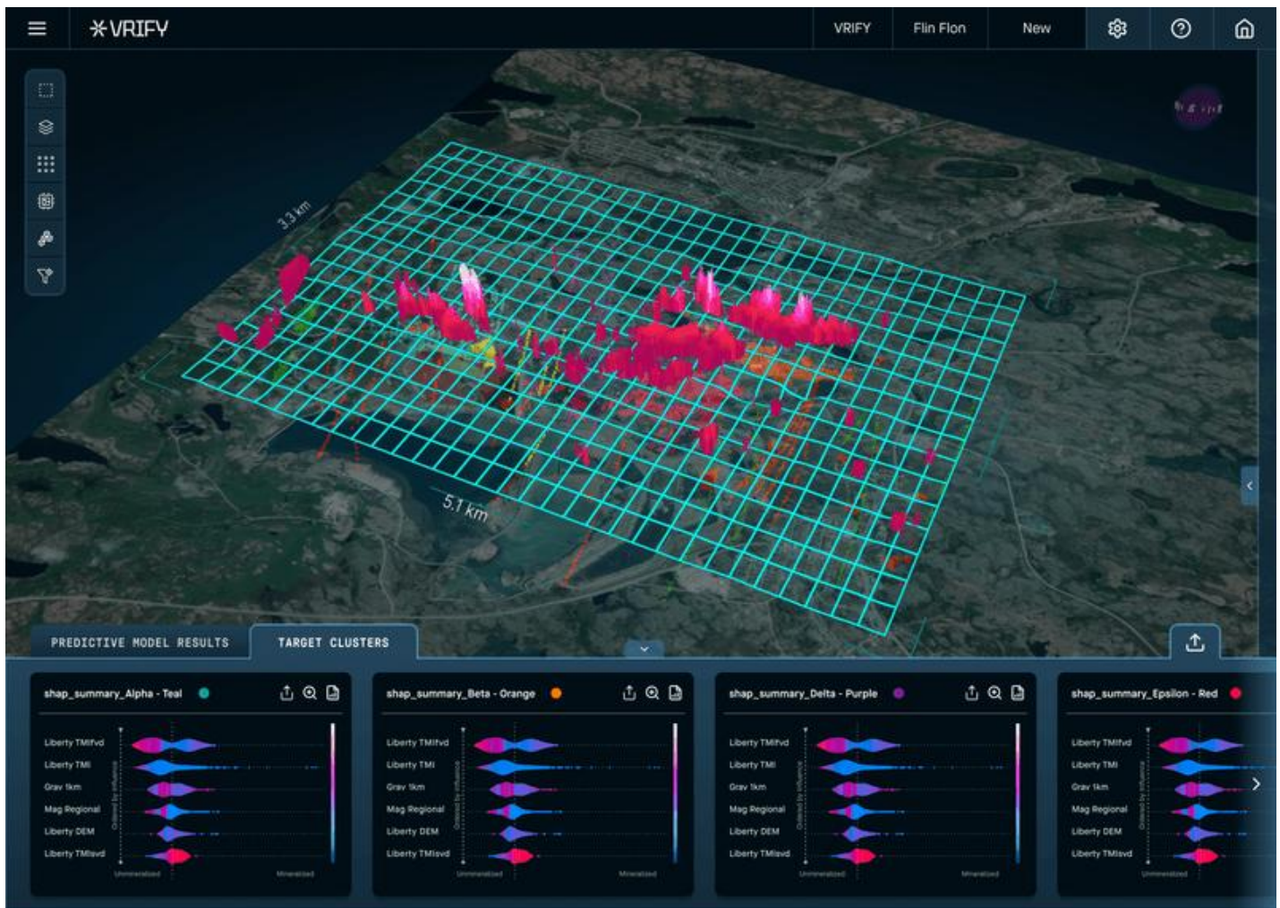
Image 1: Example of VRIFY's AI-Assisted Mineral Discovery Platform, DORA

"Highway Reward is the perfect showcase for AI-powered exploration. With over 1,000 historical drill holes, extensive mining data, and the world's highest-resolution MobileMTd drone survey, it offers an unmatched dataset for discovery. Historical production confirms a high-grade, world-class system with untapped potential—making it the ideal candidate for VRIFY's cutting-edge technology."