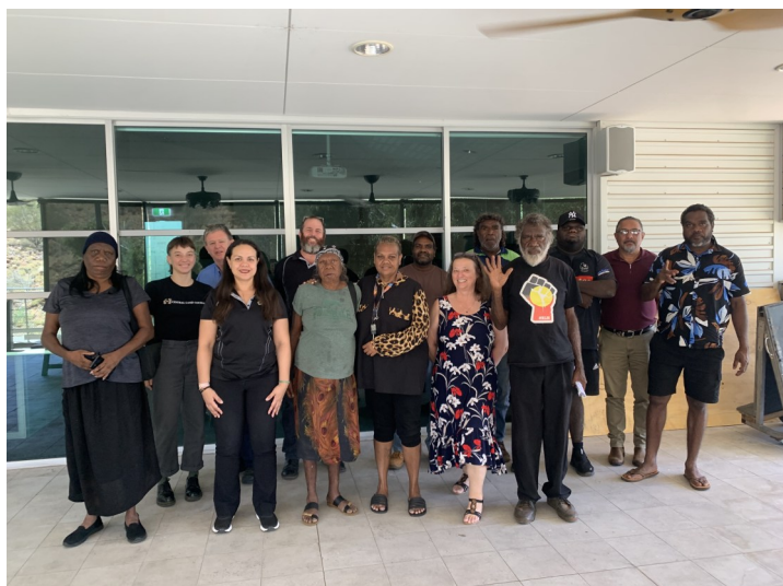
Prodigy Gold meeting in Alice Springs with CLC and TOs 2024

A key component of our engagement with Indigenous peoples are 'on country' meetings and sacred site surveys. These are funded by the company and provide assistance for the Traditional Owners to access their country, be informed about the activities completed and planned, and likely impacts and remediation conducted by the company.