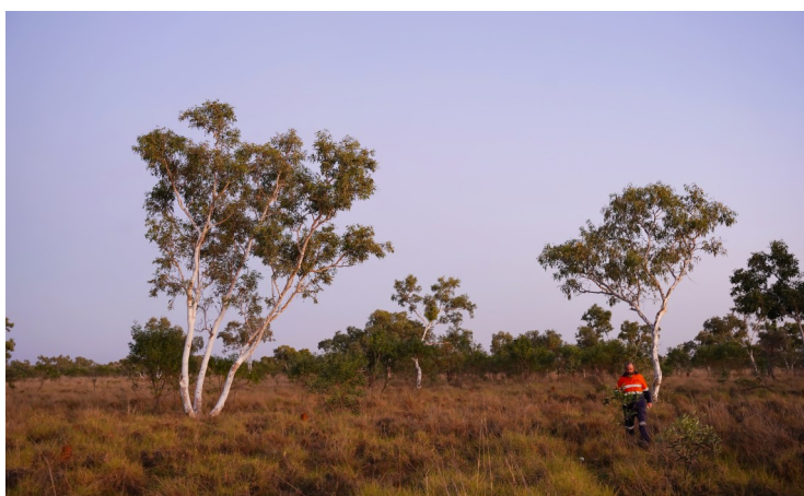
Corymbia aparrerinja - Ghost Gums.

Two environmental incidents were reported during the year, one related to wildfires that spread through the Tanami during the 2024 dry season and were close to Prodigy Gold infrastructure. The second related to an oil spill at the Old Pirate site, remediation has commenced with a longer term solution currently being developed. Additionally, several minor oil spills did occur around drilling areas but were well contained and rehabilitated quickly to limit any environmental damage.