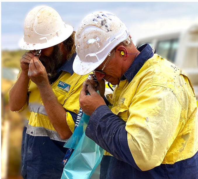
Geologists logging RC drill chips

Prodigy Gold is committed to achieving high standards of health and safety. Prodigy Gold supports a co-operative and open work environment that promotes excellence in health and safety. The company provides a safe and healthy work environment for all employees, contractors and visitors, ensuring that our operations and/or activities do not place them, or the wider community, at undue risk.