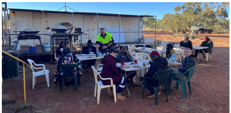
Prodigy Gold hosting TOs in the Tregony Camp during on-country meeting 2024

During the past year a new clearance certificate was obtained that covers the Tanami North project area and is valid for the next 2 years, this will allow exploration works at the Tregony and Hyperion Gold Deposits. A Work Area Program (WAP) has been submitted for the Tanami West project area which is currently being reviewed by the CLC.