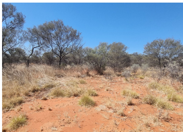
Rehabilitated drill pad encouraging re-growth at North Arunta

Additionally, key Northern Territory laws relating to our activities include the Environmental Protection Act (2019), Mineral Titles Act (2010) and Aboriginal Sacred Sites Act (1989). Exploration Agreements with Traditional Owners through the Central Land Council also outline, consultation, meetings, work approvals and reporting as laid out in ALRA.