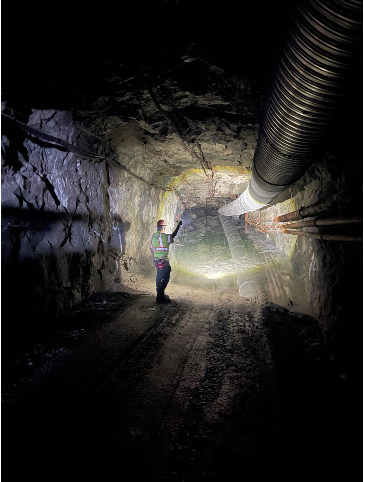
Photo 2: Water in decline prior to commencement of dewatering and restoration of services for drill access.