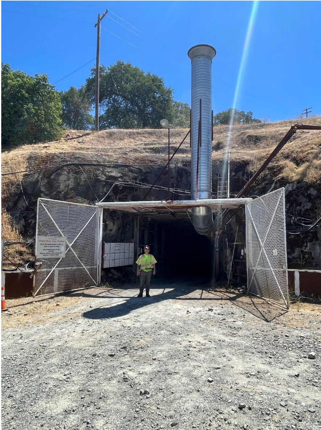
Photo 1: String Bean Alley Decline unlocked and open for action. The Decline is nearly 900m long, at a decline of 12%, attaining a depth of around 200m below surface.