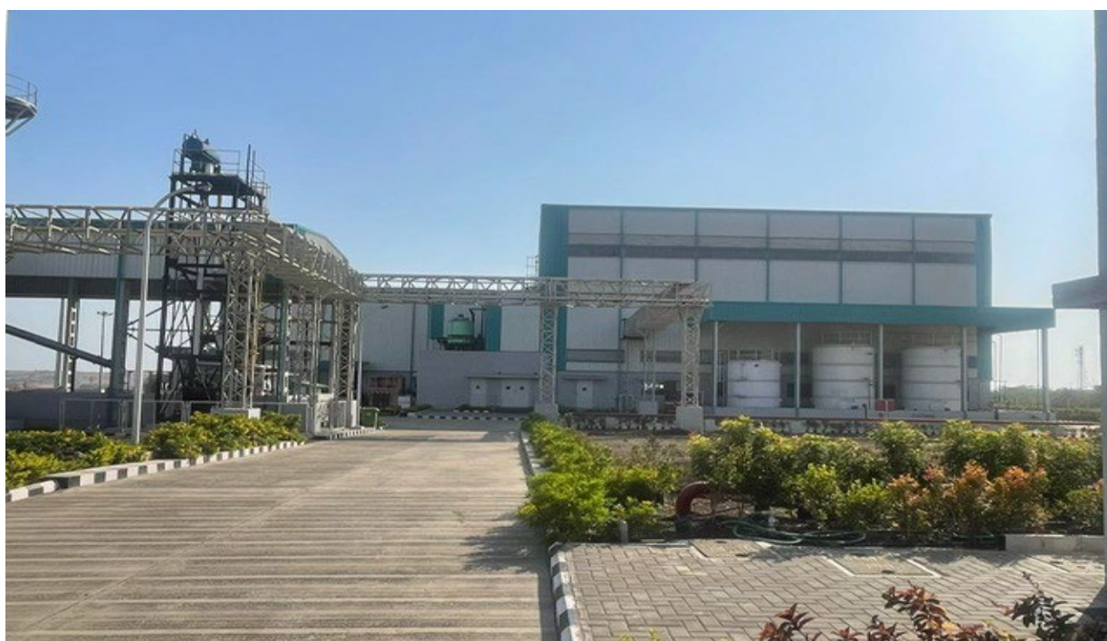
Our Expandable Graphite JV Facility near Pune, India.

Panthera Graphite Technologies is a 50:50 joint venture (JV) established with Metachem Manufacturing Co, an experienced expandable graphite producer near the city of Pune in India with over 20 years' operating history. Panthera's production facility is located in a Special Economic Zone, adjacent to key transport infrastructure. Operations commenced Q4 2024, with the first shipment made in March 2025 7 .