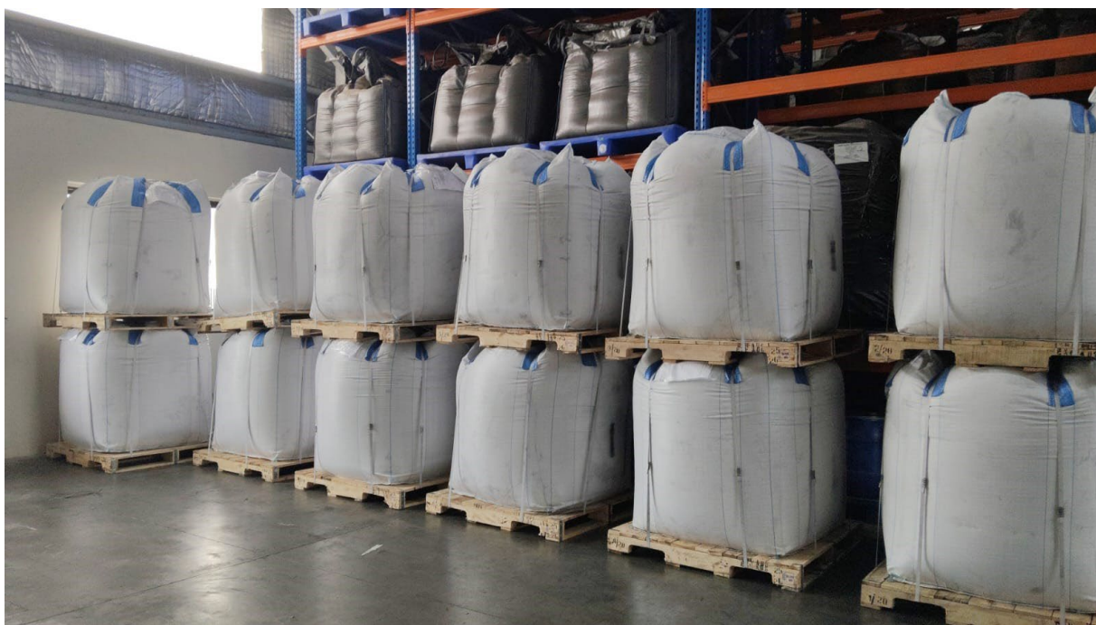
Figure 2 – Expandable graphite ready for loading and shipment to the USA.