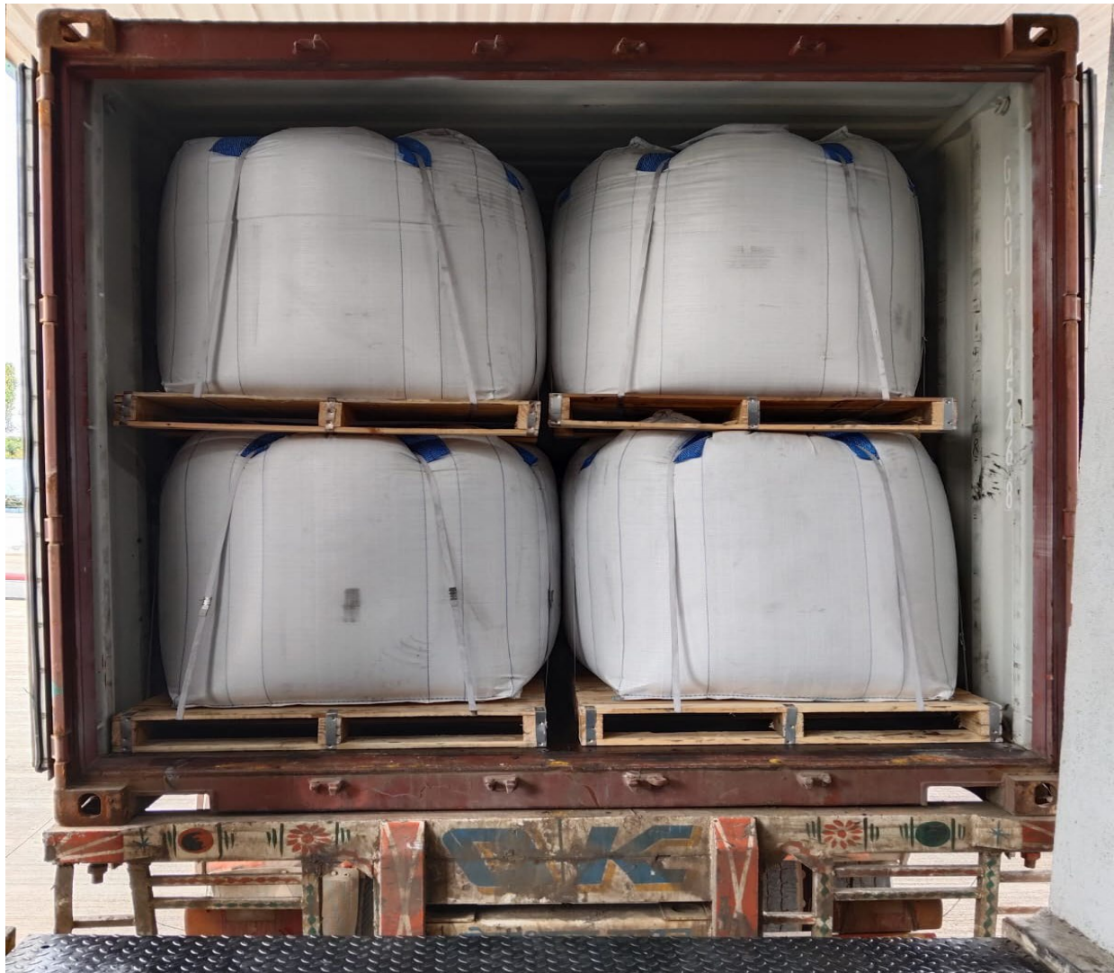
Figure 3 – Expandable graphite packed to standard for shipment to the USA.

This announcement has been authorised by the Board of Evion Group NL.