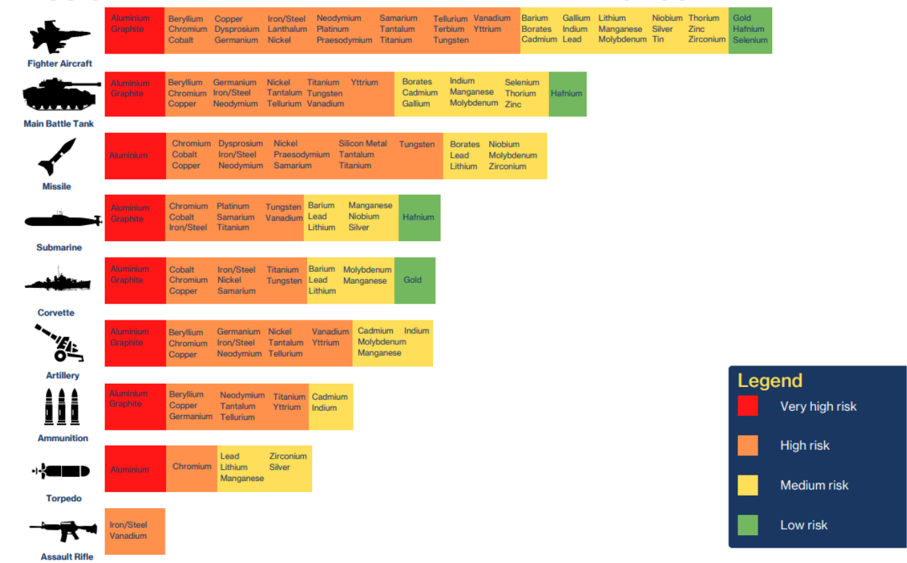
Figure 1- The Hague Centre for Strategic Studies Report recognition of graphite supply to Europe as of a very high risk to meet the demand for extensive military applications. 3