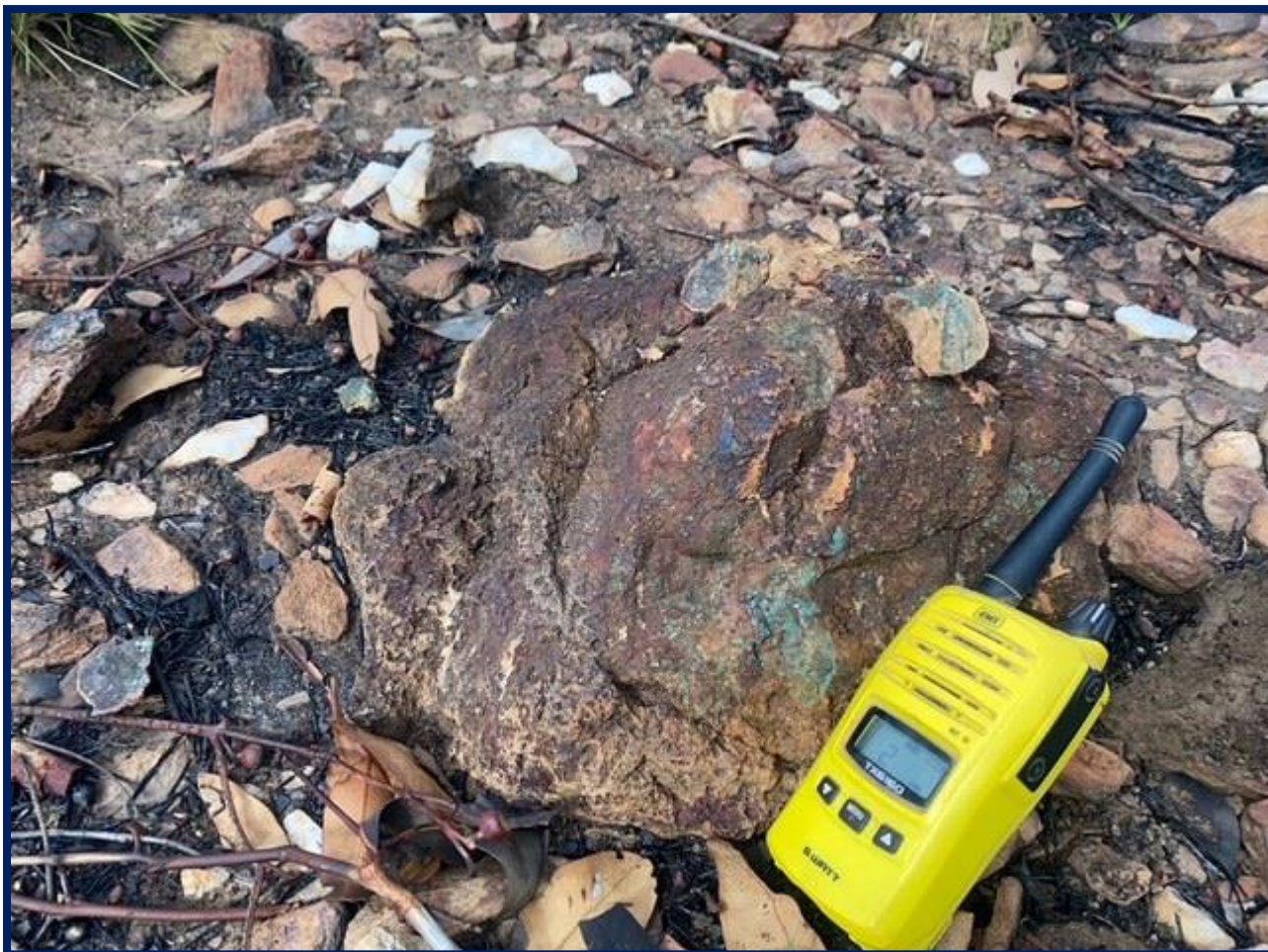
Photo 6: Blue Devil high grade copper gossans outcrop recently discovered BDR021; 52.3% Cu, 0.105 g/t Au & 5.5g/t Ag.

An on-country Heritage survey has now been completed at the Blue Devil EM target, a final report is expected over the coming weeks, following the approval of the Jaru Board. With a Heritage protection Agreement in place, the tenements are now pending government granting of tenure, a procedure now a formality process.