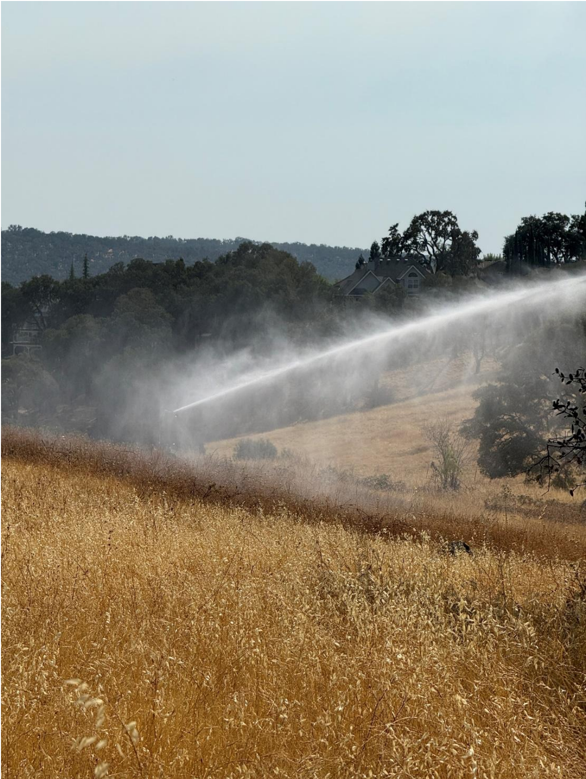
Photo 1: Clean water discharge from the Company's spray field system, signalling the commencement of dewatering from the String Bean Alley Decline.