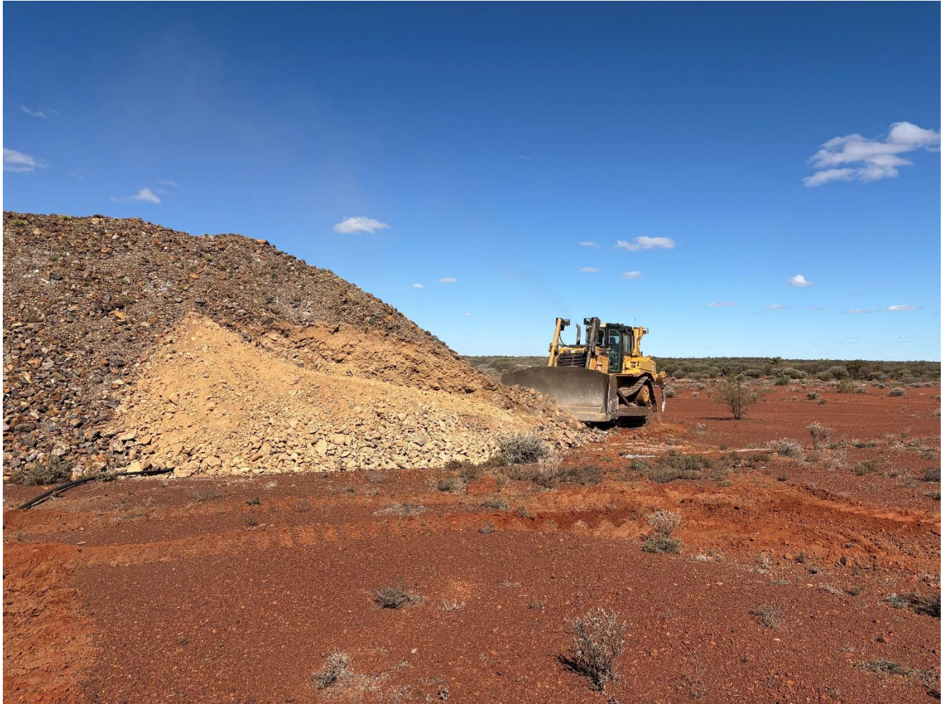
Figure 1: Restoration of access ramp to crest of the Stockpiles located on M53/127.