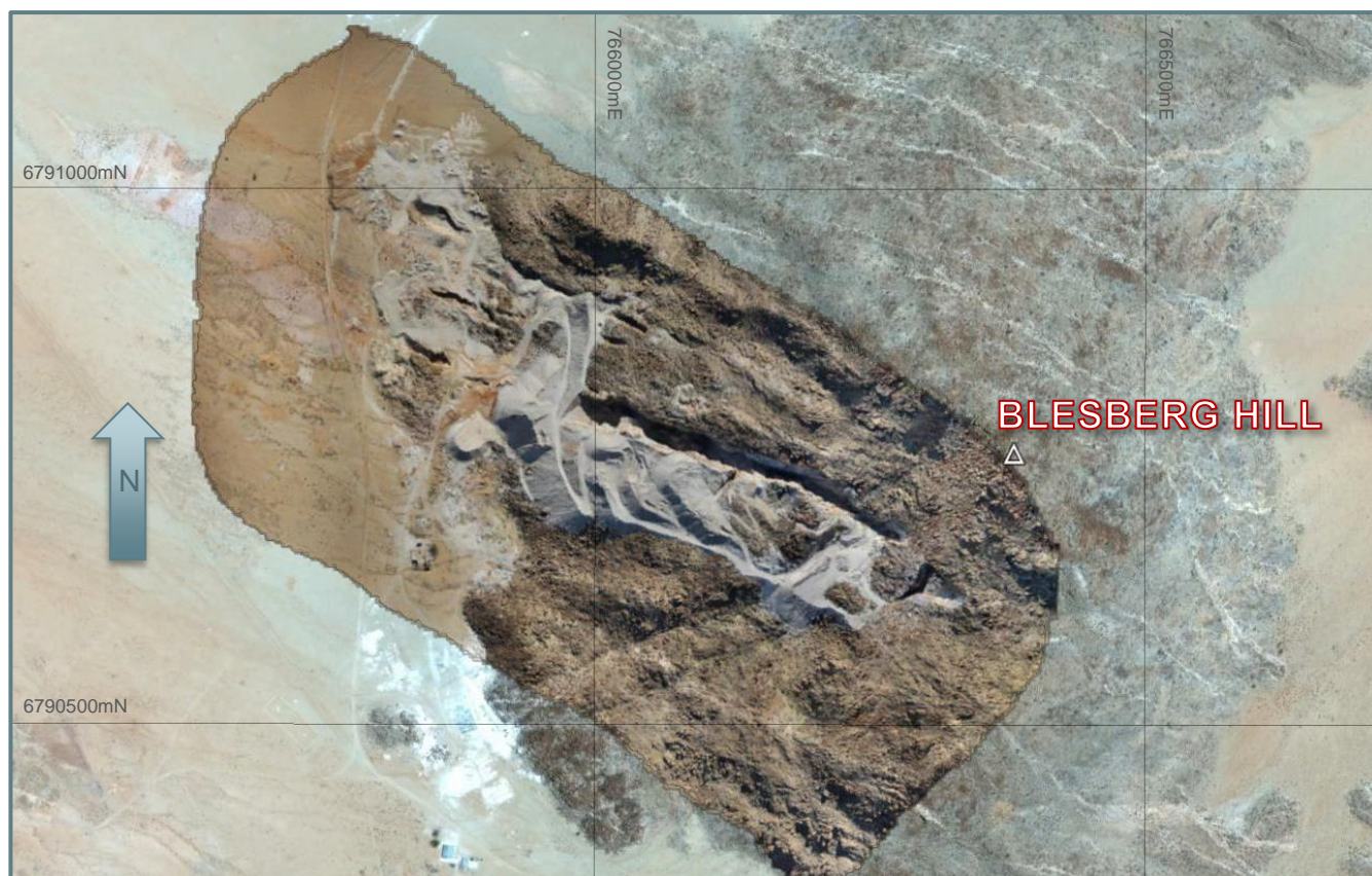
Figure 2 – Blesberg Hill showing old mine workings and numerous pegmatite veins.

The largest part of the worked pegmatite lies on the western slope of Blesberg Hill where it is exposed over virtually the full 140m vertical height of the hill (see Figure 2). The pegmatite has an exposed length of over 700 metres and it varies between 9 and 42 metres in width. The pegmatite strikes north-west and dips at angles of between 50^\circ and 80^\circ south-westward. At its north-western extremity, the pegmatite disappears beneath the sand plain ( Schutte, 1972 ), where it is unexplored.