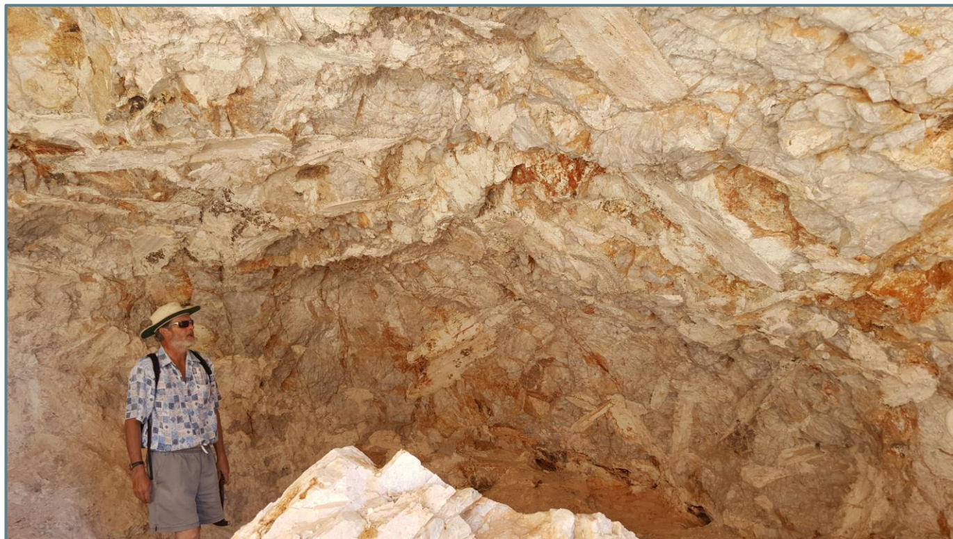
Figure 3 – Exposed mine face showing large Spodumene crystals

Figure 3 showing individual spodumene crystals up to 2m in length exposed in the excavation.