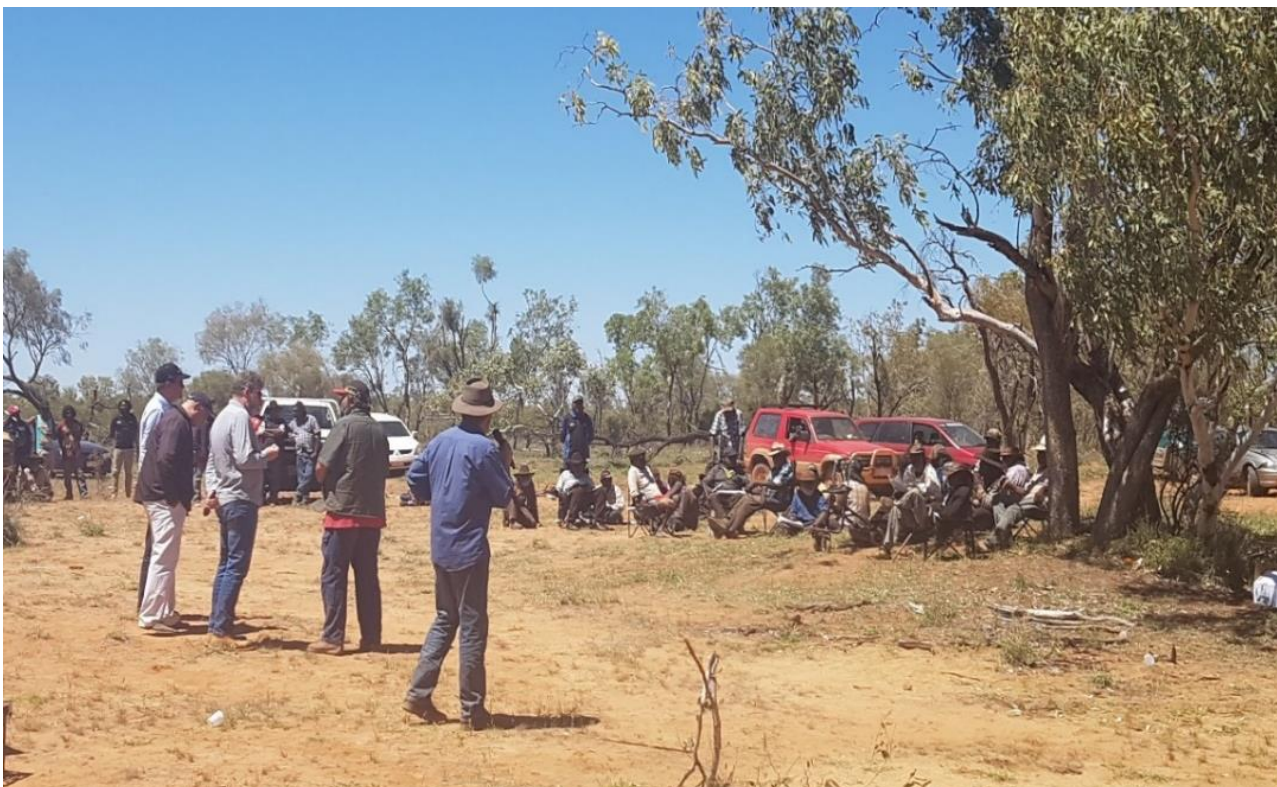
Figure 1: CLC Traditional Owner meeting at Mount Peake.