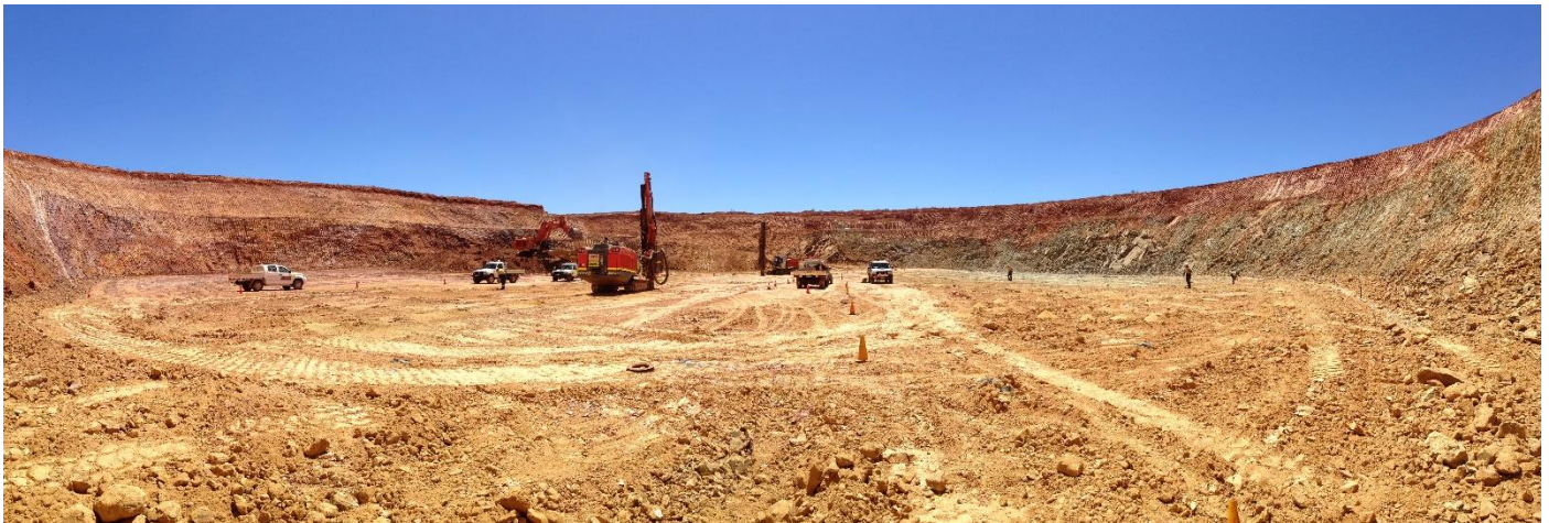
Figure 1 – Ulysses Open Pit Floor ~395mRL

Genesis Minerals Limited (ASX: GMD) is pleased to advise that it is set to receive its first cash payment under the toll milling arrangement for ore from its 100%-owned Ulysses Gold Project near Leonora in WA after successfully commencing transporting of the first parcel of ore.