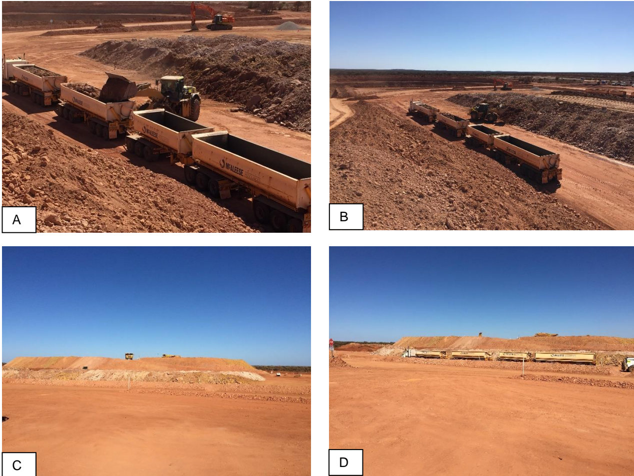
Figure 3A to D ROM Stockpile and Ore Haulage