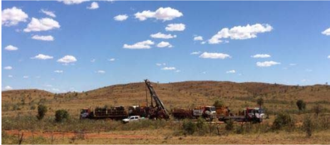
RC Drill rig on site at Mt Berghaus.

Following the recently announced upgrade of the Wingina Well resource, the Mt. Berghaus drilling continues the Company's strategy of achieving a 500,000 ounce plus combined resource at its Turner River Project in the next 6 months.