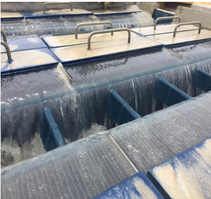
Mica Removal from The Circuit

Over the coming weeks short term production tests will continue with scheduled maintenance shutdowns to ensure reliability is sustained through the continued ramp-up to name plate production. Part of these short-term production tests are the planned phased unit process tests to improve final concentrate grade to 6%, along with further improvements to product yield.