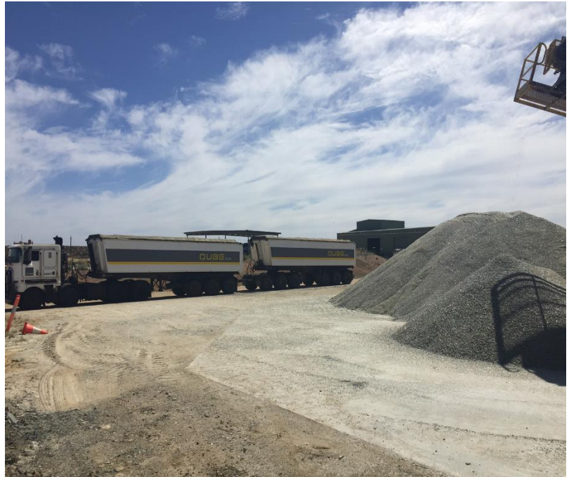
Qube Trucks Being Prepared For Loading