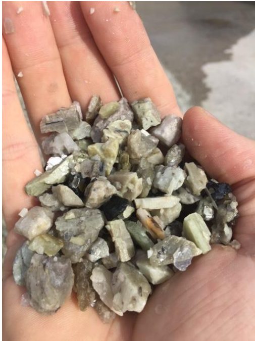
Coarse Primary DMS Product