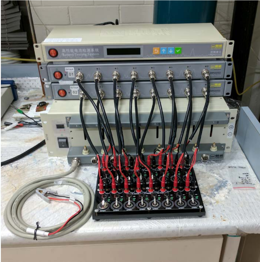
Figure 2. Hazer's battery analysis equipment within the University of Sydney

Results highlight that Hazer graphite shows outstanding irreversible capacity performance in the first discharge (first cycle), and exhibits performance over 10 cycles substantially equivalent to commercial product, with reversible capacity of 275 mAh/g and 96% capacity retention. These results highlight Hazer's graphite potential for use in the growing Lithium-ion battery market.