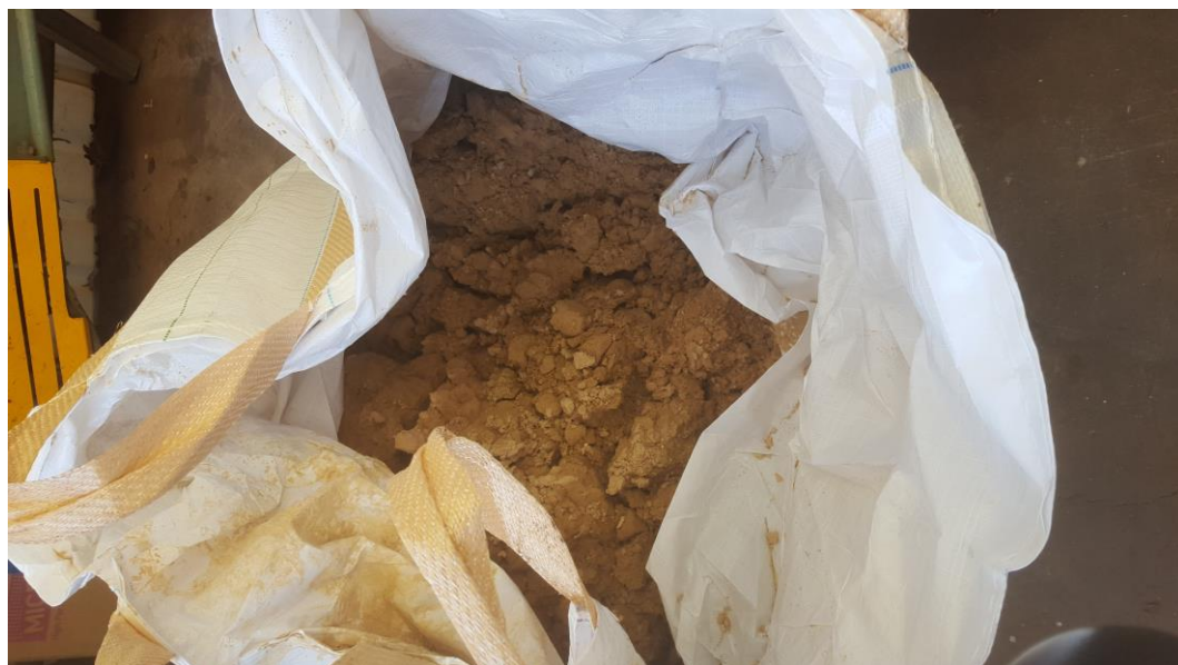
Wet concentrate cake