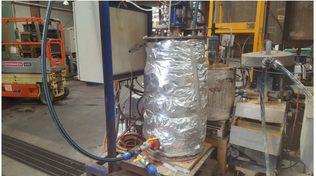
Milled feed (at 25% solids) being heated to 40°C and conditioning tanks feeding rougher bank 1