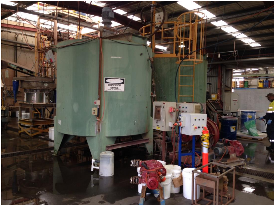
Tanks containing milled feed