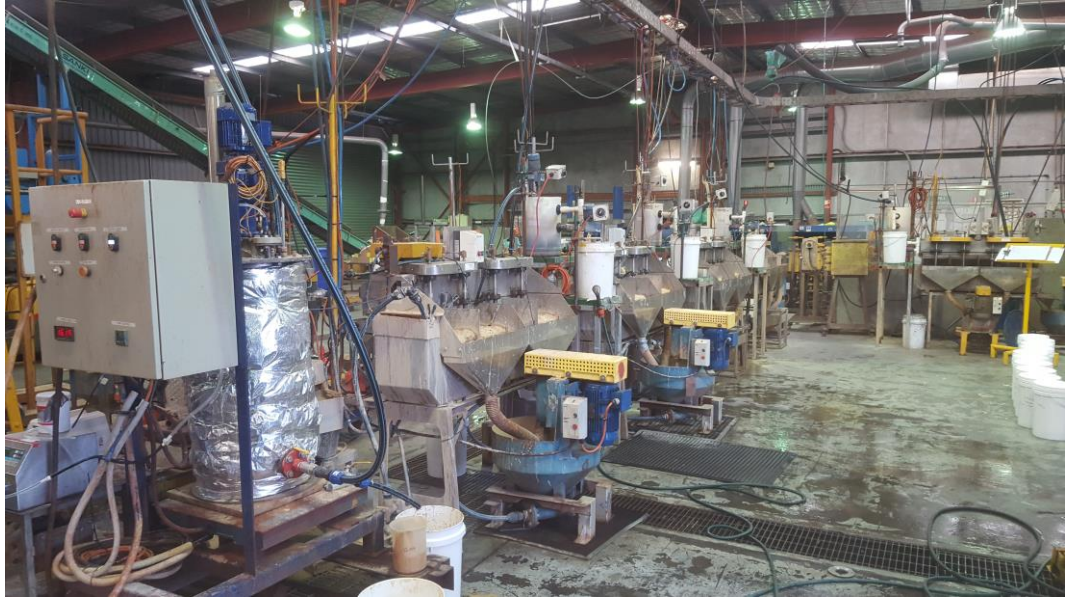
Flotation pilot plant operation