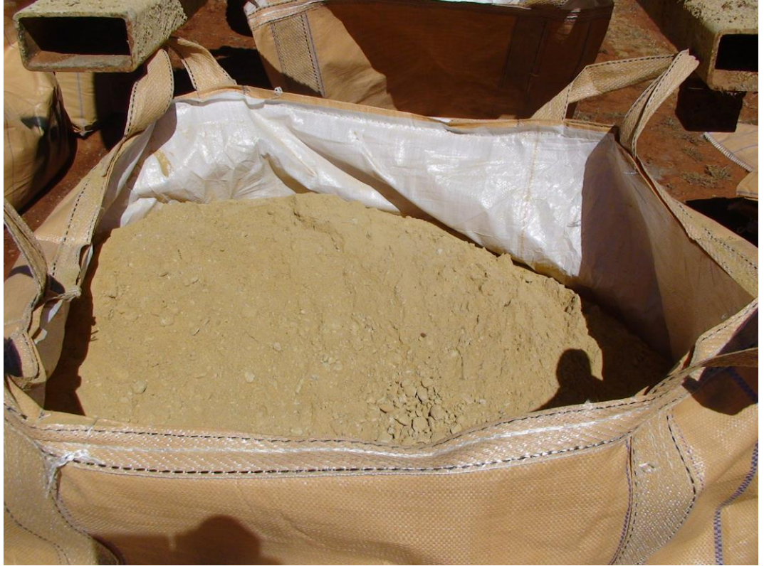
Preferred phosphate-rich rare earth-bearing material type