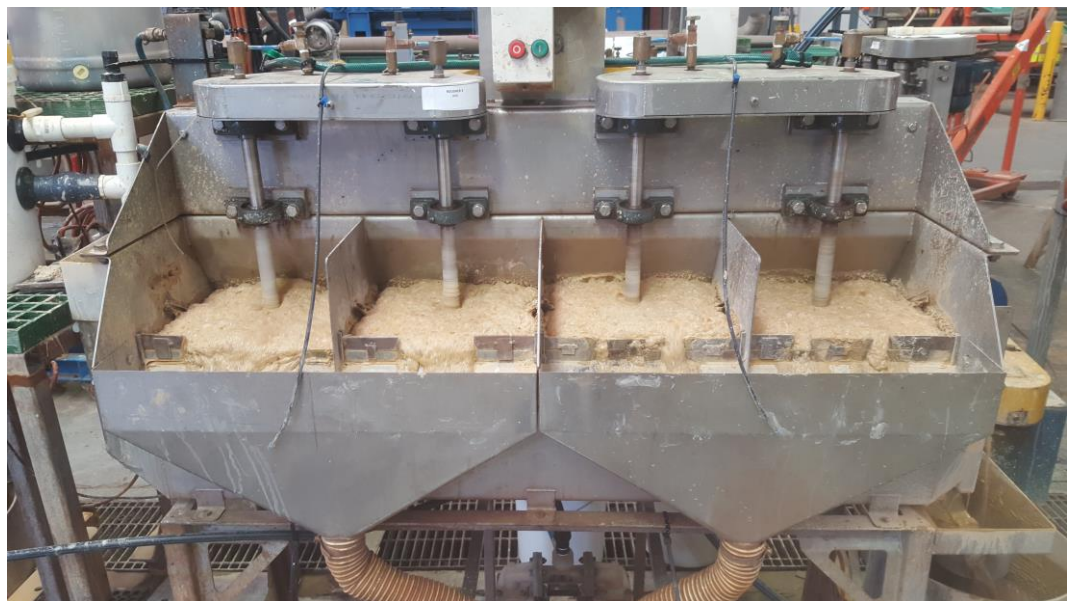
Flotation bank (rougher 1 of 3)