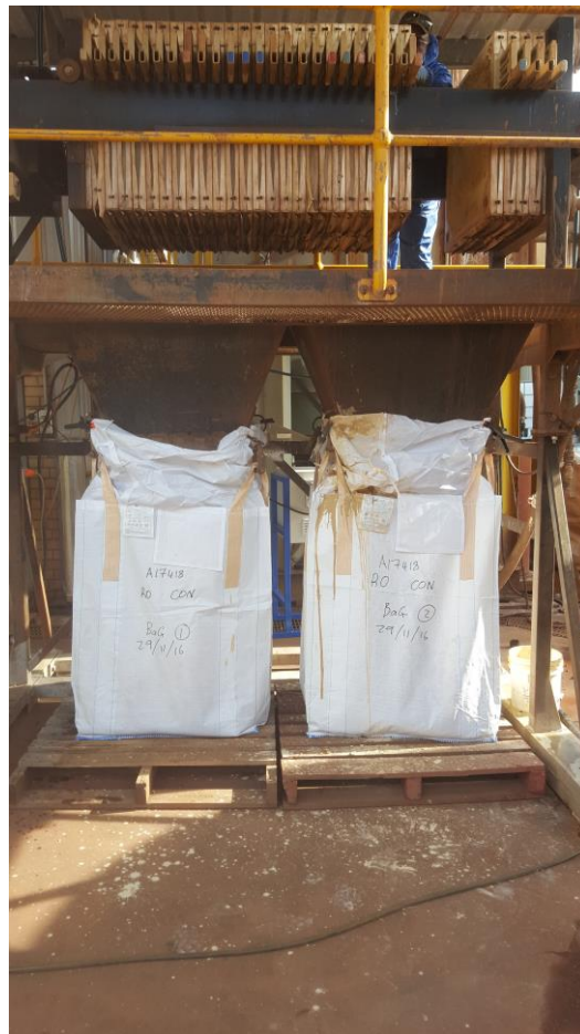
Wet concentrate collection beneath filter press (approximately 500 kilograms per bulk bag)