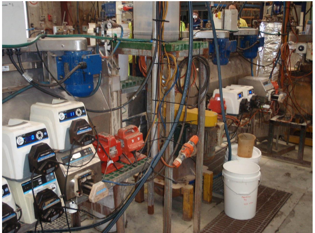
Flotation reagents pumping station