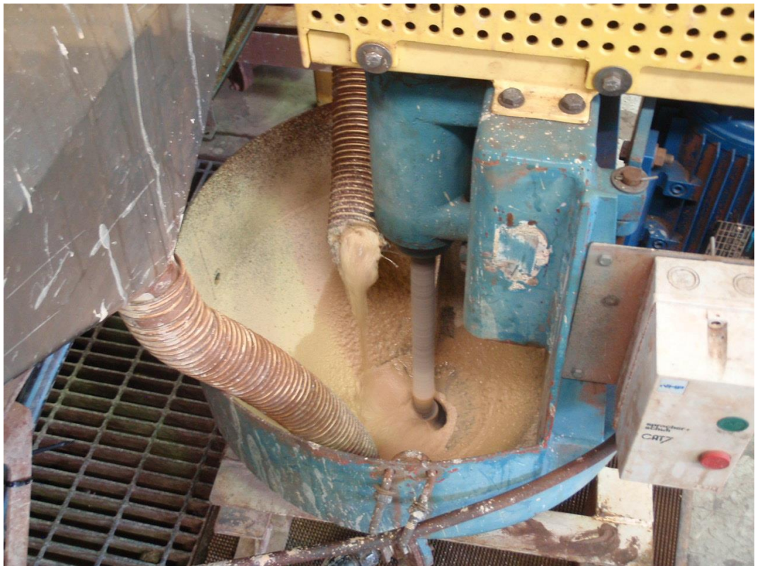
Final concentrate slurry