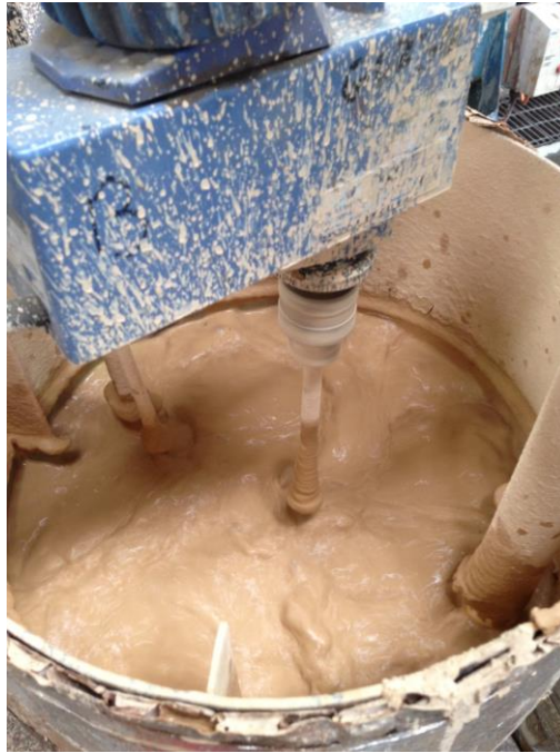
Milled feed inside conditioning tank