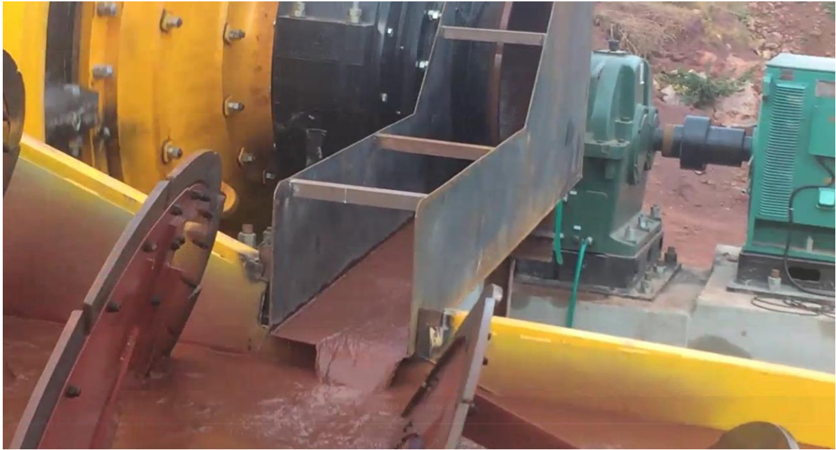
Ball mill and classifier