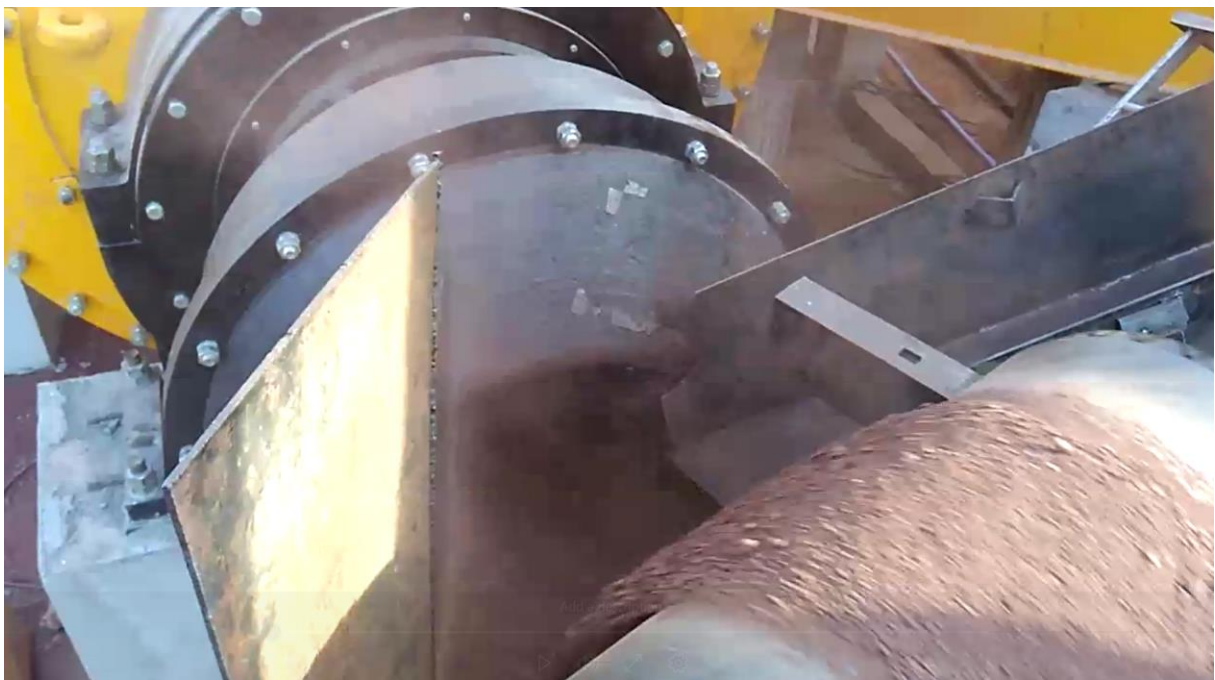
Low grade fines into ball mill

Cedric Goode NSL Consolidated +61400 408 477