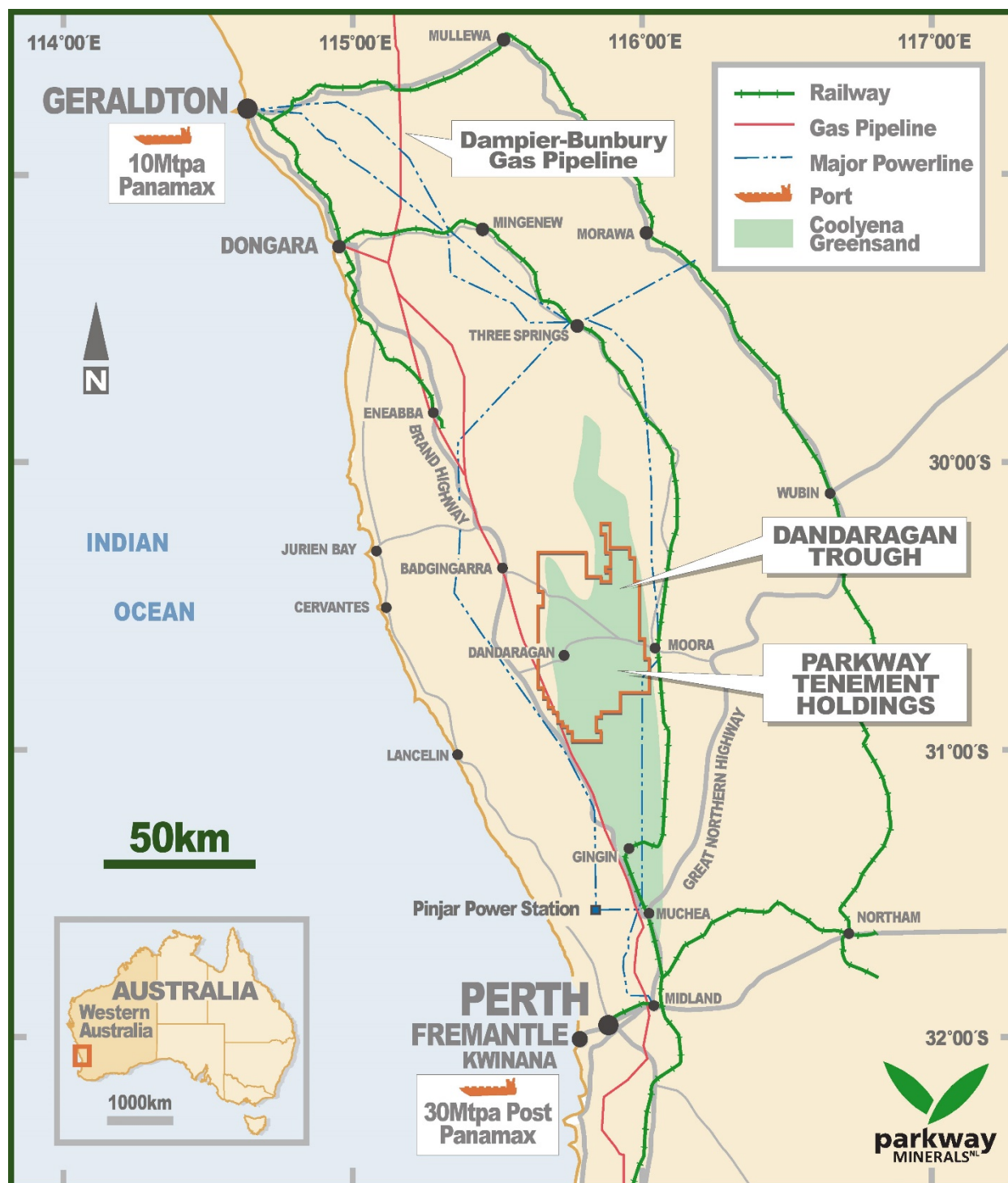
Figure 1: Location plan, Dandaragan Trough Project

Potash West NL (“PWN”, “Potash West” or “the Company”) has continued to advance the Dinner Hill Potash and Phosphate Deposit, located some 200km north of Perth in Western Australia, (Figure 1). Dinner Hill forms part of the larger Dandaragan Trough landholding, where Potash West holds over 2,000km 2 of exploration tenure. Sedimentary rocks within the trough contain glauconite, a potash rich mica, and phosphate nodules. The objective is to produce phosphate and potash fertilisers and a range of valuable by-products from the phosphate and glauconite present within the sediments of the Dandaragan Trough.